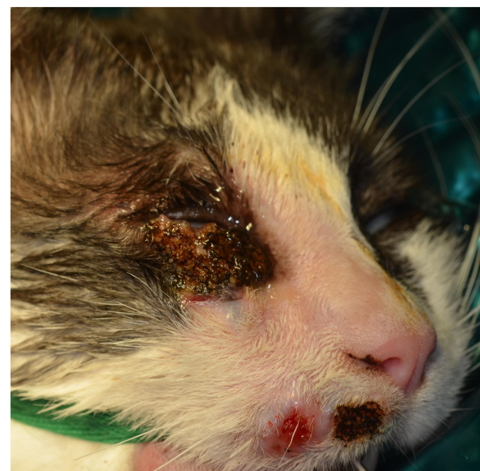
Fig. 4: Immediate post-operative appearance

Management. Due to the extent of the mass, surgical excision was not deemed suitable. Diode laser photovaporisation (600 nm contact fibre, Lumix Surgery Dual, Fisioline) was performed at a fluence of 2,7 J/cm, under general anesthesia (Fig. 3-4). Post-operative care included topical fusidic acid ointment on the lesions and systemic amoxicillin-clavulanic acid for 1 week.