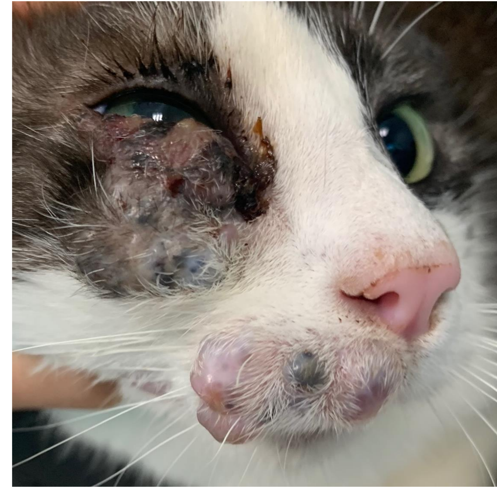
Fig. 1: Initial clinical presentation

Complementary examinations. Superficial ultrasonography (22 MHz) confirmed the presence of multiple anechoic cavities. Bacteriological culture of the cyst fluids yielded negative results. Histopathological analysis of incisional biopsies revealed multiple apocrine secretory adenomas and apocrine ductular adenomas, accompanied by significant secondary pyogranulomatous inflammation (Fig. 2), thereby confirming the diagnosis of apocrine cystadenomatosis.