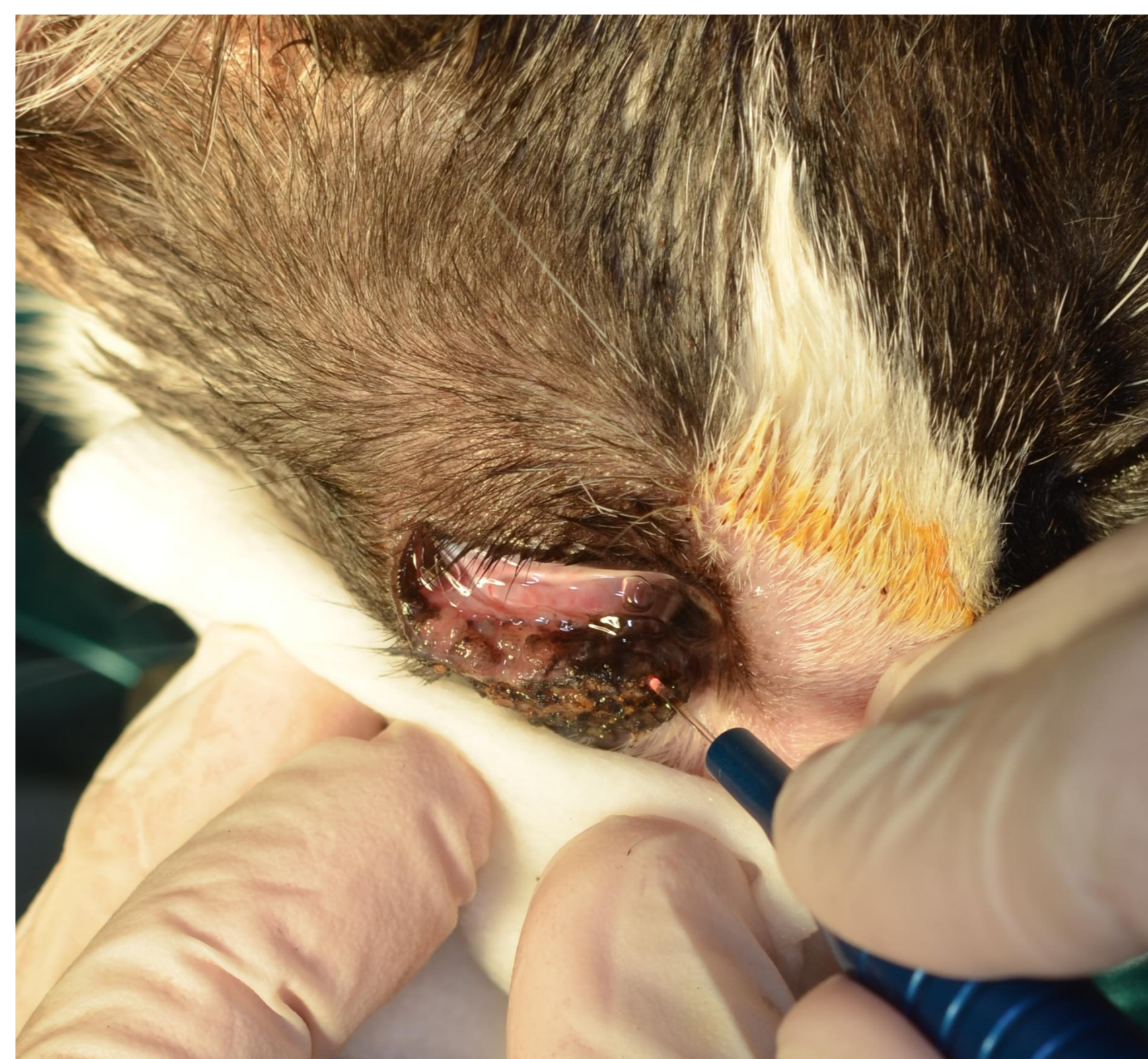
Fig. 3: Diode laser photovaporization