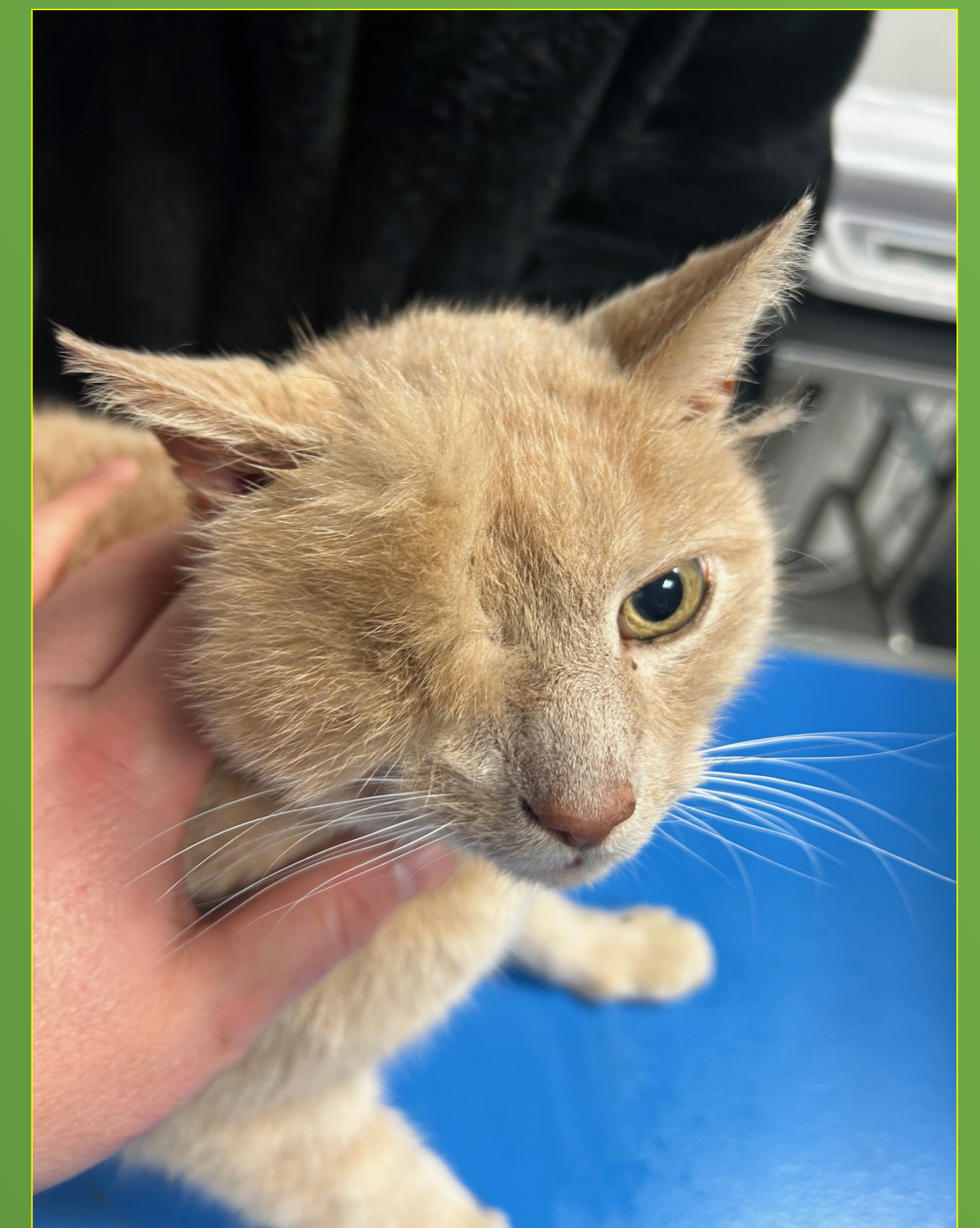
Figure 7 : 11 months post operative aspect