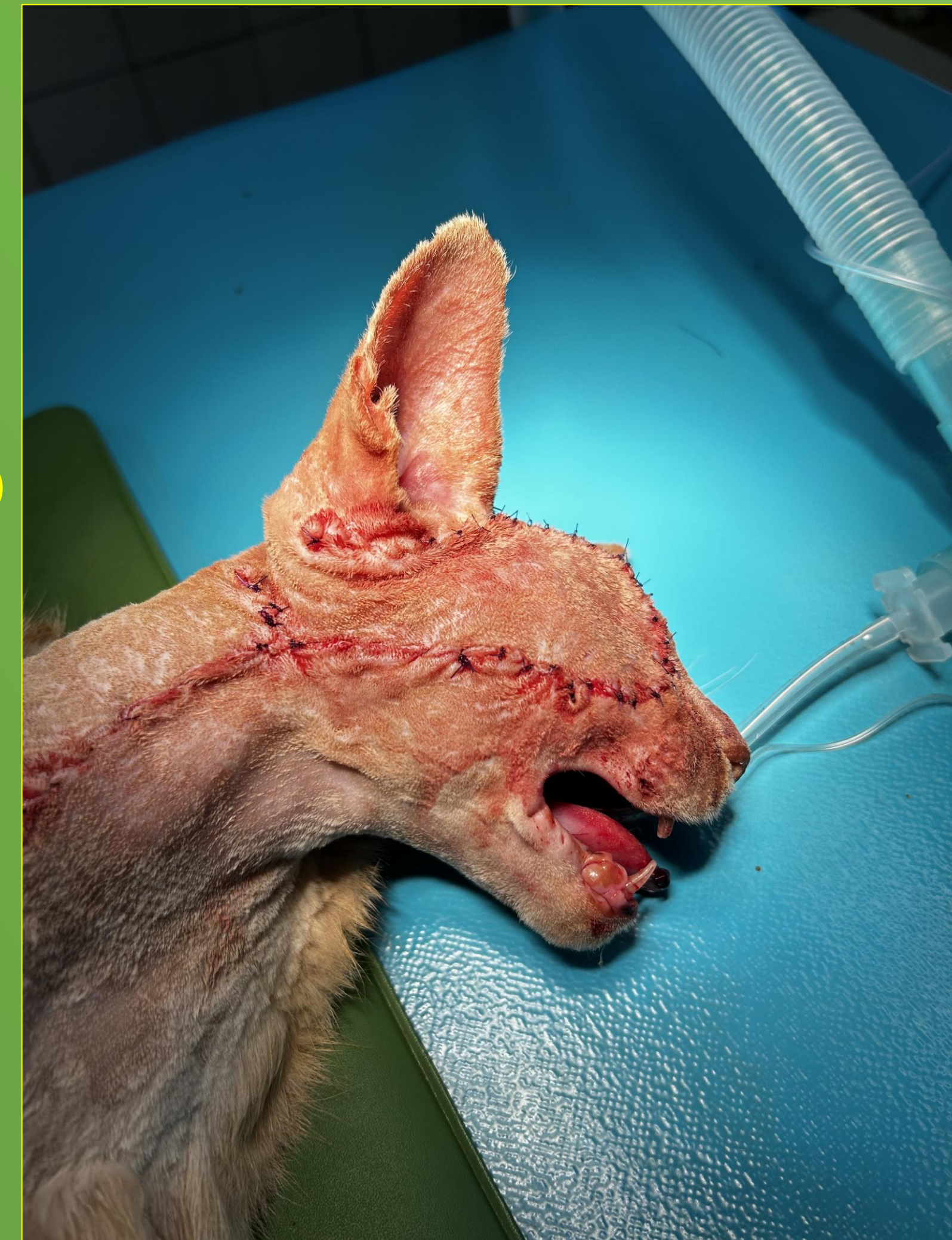
Figure 5 : Immediate post operative aspect