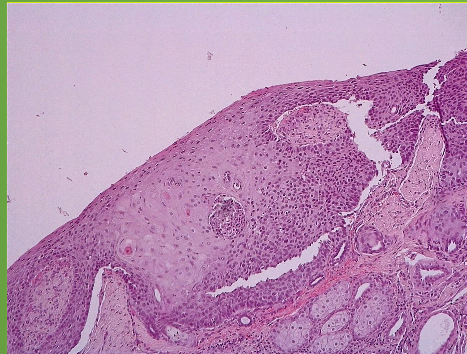
Figure 2 : Anatomopathological aspect of the first biopsy