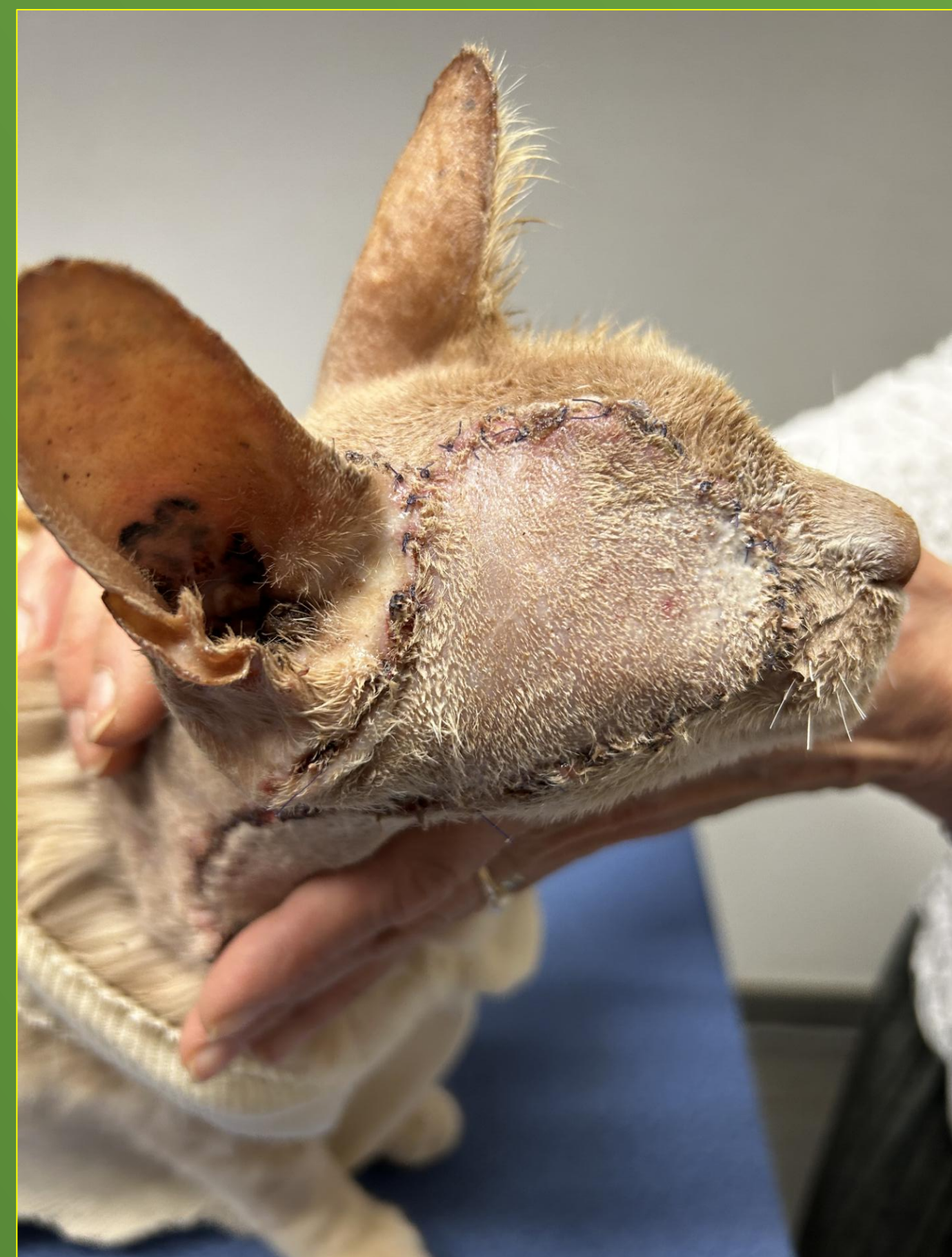
Figure 6 : 15 days post operative aspect