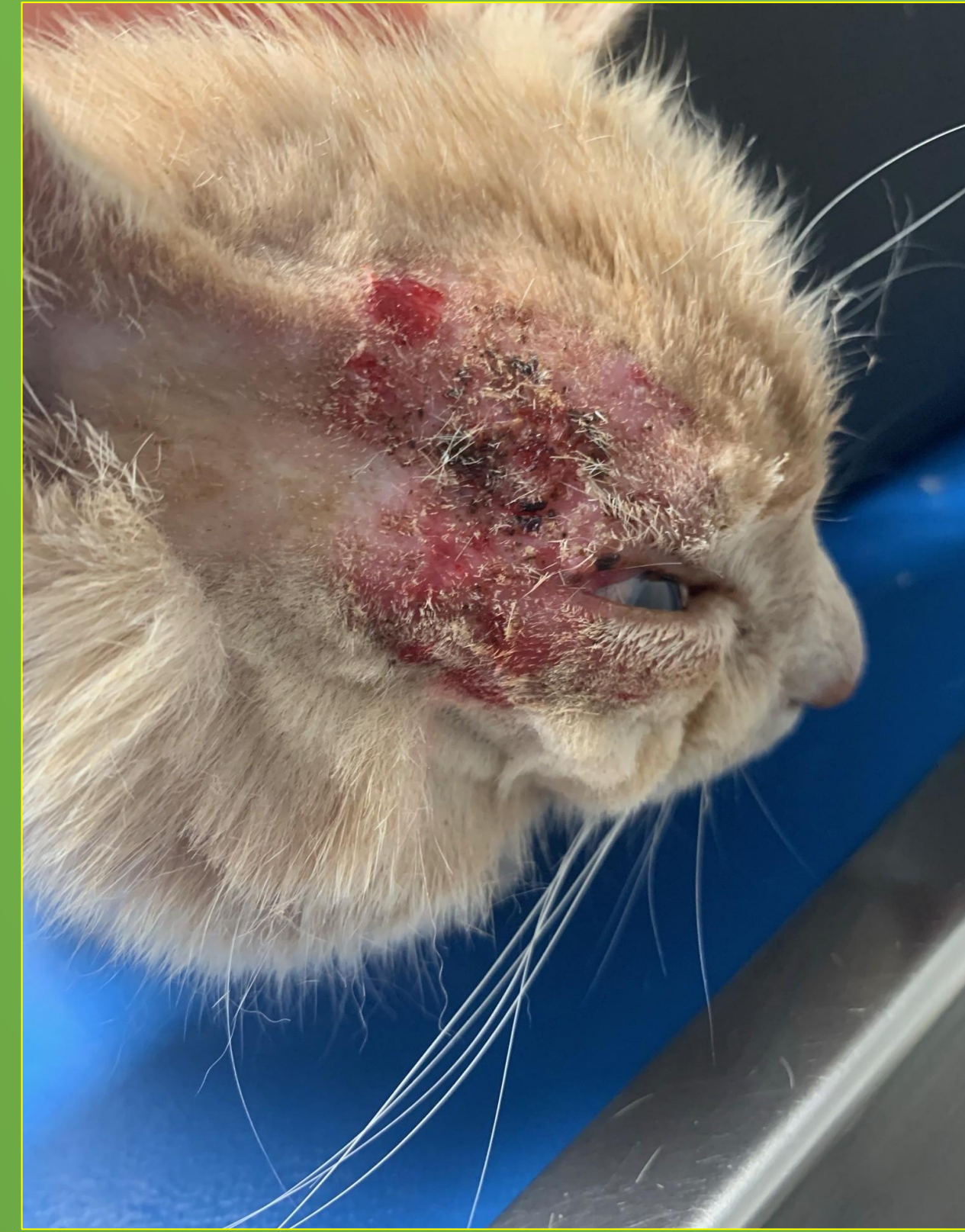
Figure 1 : Aspect at first presentation

To describe a clinical case presenting an uncommon disease : Feline Bowenoid In Situ Carcinoma (BISC) in the periocular area and its multimodal treatment. The author doesn't declare any conflict of interest.