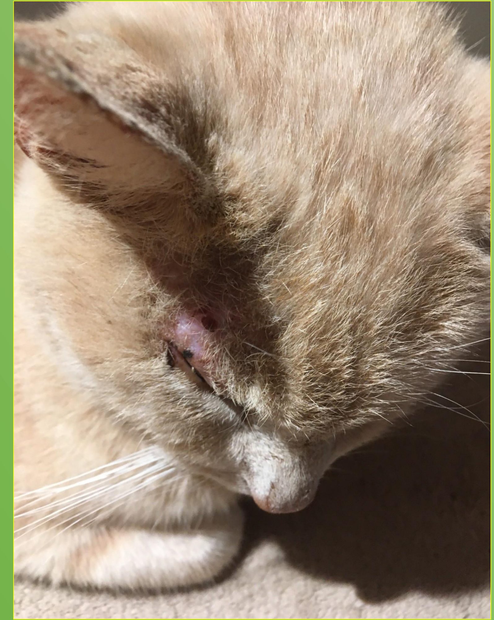
Figure 3 : Aspect after three sessions of daylight PDT