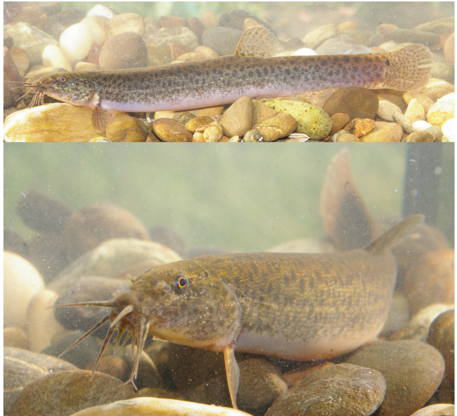
Figure 3. Two specimens of dojo weatherloach M. anguillicaudatus caught in the Schadgraben stream at Geispolsheim on the 19 th May 2022. The upper picture shows the pigmentation pattern of the body, low adipose crests on the caudal peduncle and the presence of a block spot at upper caudal base. The bottom picture highlights the long barbels.

The Neighbour-Joining analysis with the 235 COI sequences (607 bp) of the reference dataframe puts the five weatherloaches from the Schadgraben stream within the Misgurnus anguillicaudatus cluster (Figure 4). Our specimens share the same haplotype with four sequences from the Yangtze drainage (Wuhan, China: KP112321, KP112320, MF122497, MF122502) and one from a Canadian aquarium (KX224162).