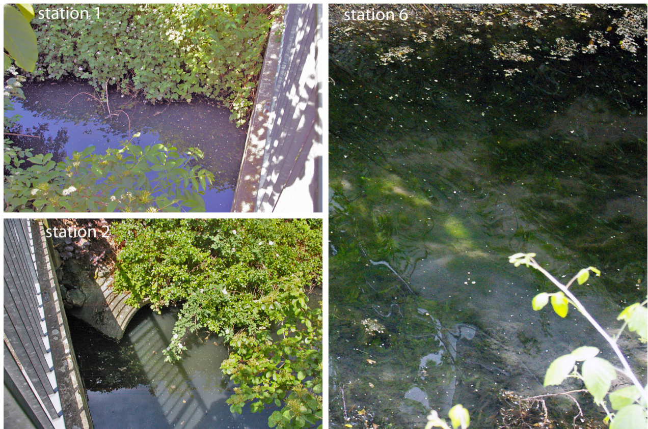
Figure 2. Stations features where dojo weatherloaches M. anguillicaudatus were caught in the Schadgraben stream at Geispolsheim on the 19 th May 2022: upstream and downstream from the bridge rue des Suédois (stations 1 and 2), upstream the bridge of Lingolsheim road (station 6).