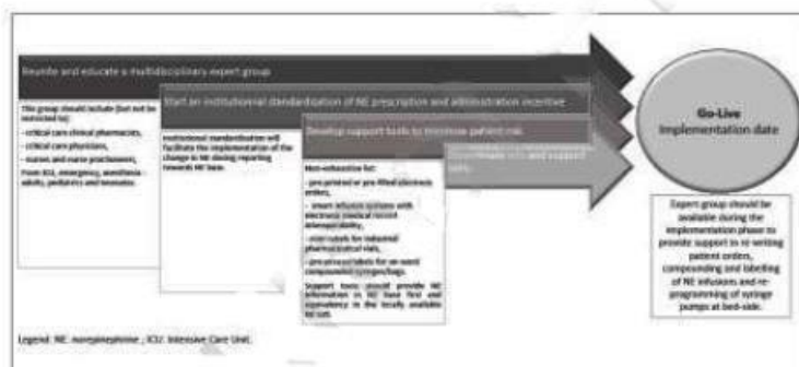
Figure 2 Step-by-step implementation of the Position Statement on norepinephrine dose reporting

Clinicians will also have to learn to interpret newly calculated clinical severity and prognostic scoring tools as well as clinical trial results or recommendations in the light of norepinephrine base dose reporting. For example, the impact on the SOFA score is interesting. The discrepancy in norepinephrine dose reporting induced consistently higher SOFA scores in French patients versus North American patients. When comparing critically ill patient cohorts from France and North America, one could erroneously think that French patients are systematically more severe than North American patients. With uniformization of norepinephrine doses reporting in base, French patients will see their calculated mortality risk significantly decrease (Table 2). Since the SOFA score was initially developed in Europe, probably based on norepinephrine conjugated salt dosing units and then applied worldwide with various norepinephrine dosing units, prospective international studies will be needed to address this uniformization in calculation and its impact on SOFA score prediction of patient mortality [6].