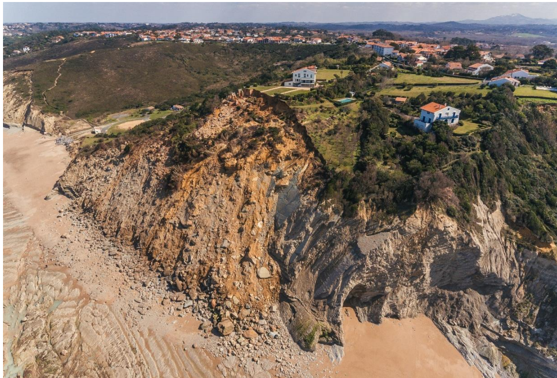
Figure 1: Itxas Gaïna compound landslide at Bidart, with rock block slide in marls and landslide in upper alluviums

The generic methodology developed here for flysch seacliffs aims to enable to characterize coastal instability types and retreat rates by field observations and simple indices. This method tested and validated for different flysch facies might be used in other geological contexts.