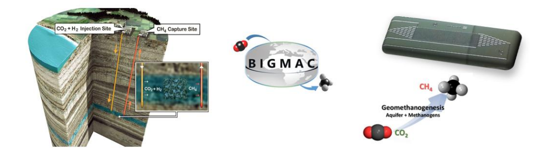
Figure 1: Deep underground CO<sub>2</sub> bioconversion

The tools and approaches that we are developing and using will make it possible to simulate these deep ecosystems, to estimate the yields of such approaches and the possibility of testing exploitation scenarios.