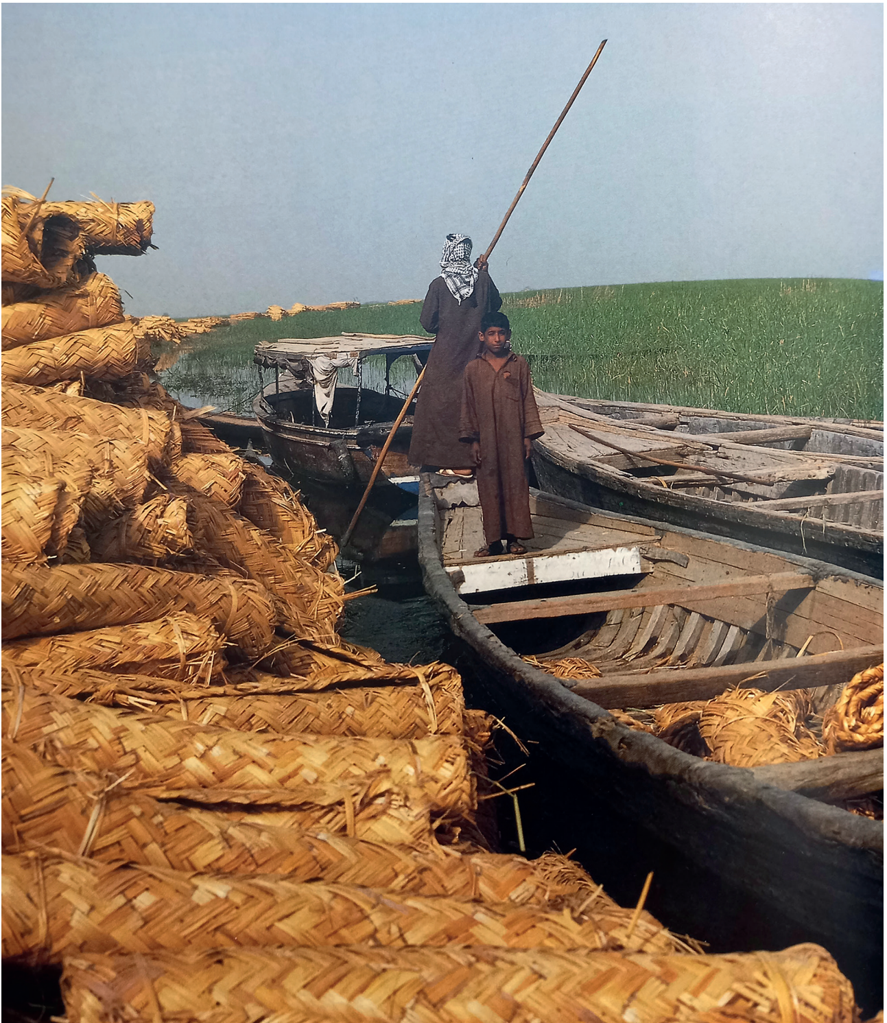
Fig. 4 – Mats used as a building material ready to be transported in southern Iraq (Roaf, 1990, p. 50).

Fig. 4 – Des nattes utilisées comme matériau de construction prêtes à être transportées, dans le sud de l'Irak (Roaf, 1990, p. 50).