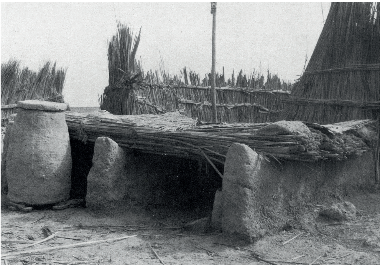
Fig. 1 – Bed built with mud and reeds, covered with a vegetal mat (Ochsenschlager, 1974, p. 172).

Some works corresponding to the prehistoric periods of the Iberian Peninsula have recorded the presence of mat imprints in hardened mud fragments that could correspond to architectural uses, but this presence has either not been interpreted as a result of its function as a construction material, but rather as remains or impressions of possible containers (e.g. Moralejo et al., 2015; Aura et al., 2020), or would not have been the object of further attention.