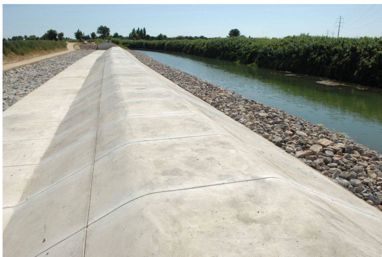
Figure 3: Picture of a collective protection structure, a dike with a spillway, presented to Group 3.

'We will give you a little more information on flooding: in your case, when a home is said to be inside a flood-prone area, this means that it has been flooded three times in the last 50 years. During these floods, the water rose to 50 centimeters inside the house. Recently, the public authorities have carried out mitigation works (construction of dikes, an evacuation channel) to reduce the risk of flooding in your municipality, as shown in this photo [the photo from Figure 3 is presented on a large-sized sheet]. These constructions protect against all floods less than or equal to the 100-year flood, i.e., a flood that occurs an average of once in 100 years.'