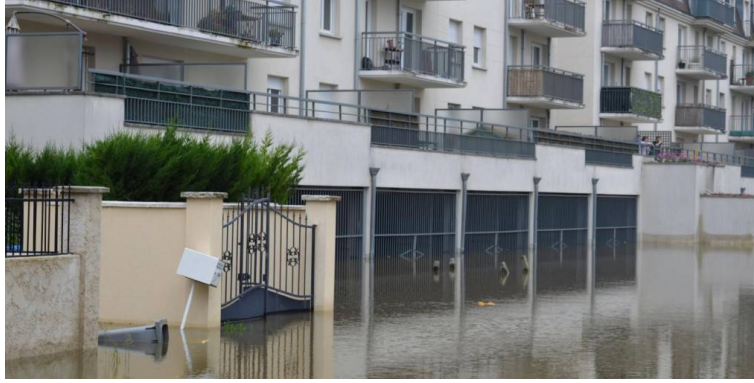
Figure 2: Picture of a flooded building presented to Group 2.

'We will now present you with five different situations with choices to make. What home would you choose if you had to make your choice today?' [The five choice sets of the randomly selected block are presented in turn to the respondents.]