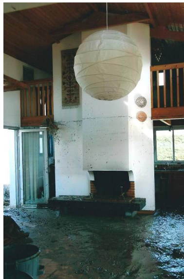
Figure 1: Picture of a flooded ground floor of a home presented to Group 2.

'The furniture and personal belongings on the ground floor were damaged as shown in this photo [the photo from Figure 1 is presented on a large-sized sheet] and the members of the flooded household had to clean the floor and walls. Insurance reimbursed the flooded household for the cash value of the furniture.'