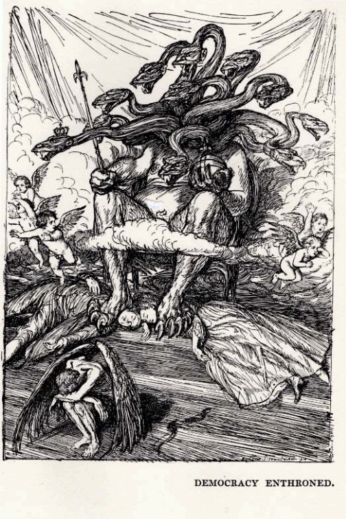
Fig. 4: Edmund J. Sullivan, 'Democracy Enthroned,' in The French Revolution: A History , 1910, vol. II opposite page 92, photographic line block, 15cm x 11cm