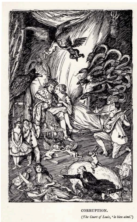
Fig. 3: Edmund J. Sullivan, 'Corruption, ( The Court of Louis, "le bien aimé." )', in The French Revolution: A History , 1910, frontispiece to vol. I, photographic line block, 16.6 cm x 10.6 cm