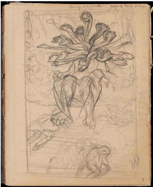
Fig. 5: Edmund J. Sullivan, sketch for 'Democracy Enthroned,' pencil on paper, sketchbook size 20.3 cm x 16.3 cm, Victoria and Albert Museum, E7-1973 (@Victoria and Albert Museum, used with their permission for non-commercial purposes : https://collections.vam.ac.uk/item/O562001/sketchbook-containing-preliminary-studies-by-drawing-sullivan/ )