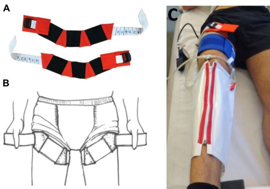
FIGURE 2 | Illustration of thigh cuffs. (A) Thigh cuffs are elastic strips that can be adjusted to the size of the thigh with a clamping segment (white segment); (B) Thigh cuffs are worn on the upper thigh. (C) Individual adjustment of thigh cuffs with plethysmography to apply a 30-mmHg pressure on the upper thigh, performed at baseline data collection (BDC)-2.

continuously subjected to video monitoring. Bodyweight, blood pressure, heart rate (HR), and tympanic body temperature were measured daily. Water intake was fixed at 35–60 ml/kg/day. Within these limits, water intake throughout the protocol was ad libitum and quantified. The menu for each experimental day was identical for all participants, and dietary intake was individually tailored and controlled during the study. Measurements of HR and arterial blood pressure were performed with an automatic device twice a day (morning and evening). VO_{2max} was measured in the evening of B-2 and R0. Percent change in plasma volume on DI-1-evening, DI-3-morning, DI-5-morning, DI-5-evening, R0-morning, and baseline (DI-1-morning before the onset of immersion) was estimated using Hb and Hct count (Dill and Costill formula).