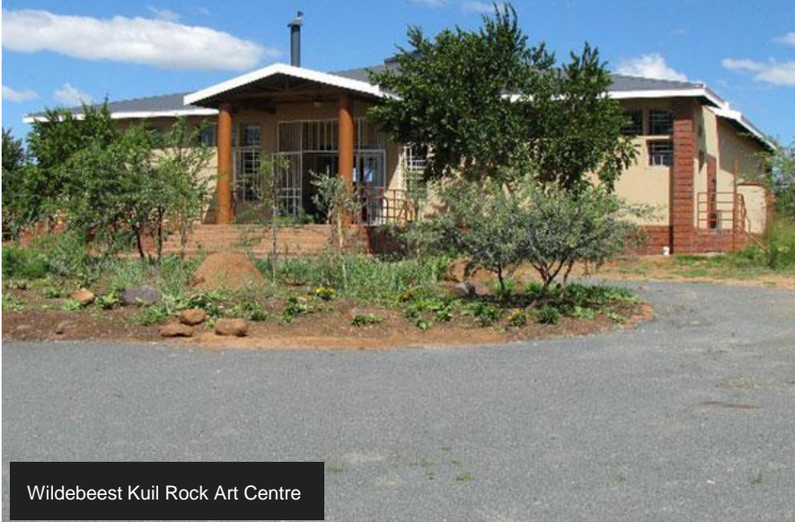
Wildebeest Kuil Rock Art Centre

Several objectives: to highlight the country's neglected heritage and inform, educate and inspire South Africans about it; to create jobs through tourism at rock art sites; and to protect rock art sites through responsible development.