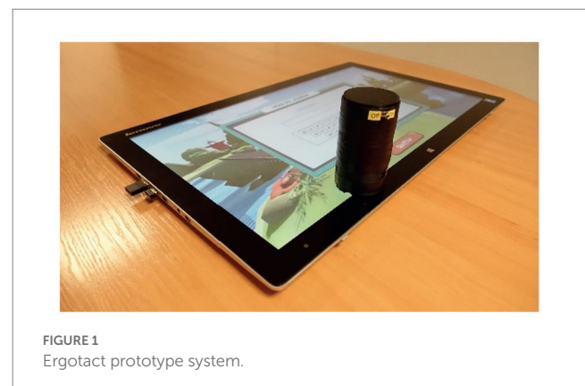
FIGURE 1 Ergotact prototype system.

The Ergotact prototype is shown in Figure 1. The tangible object was cylindrical in shape and was made using a custom-made 3D printing tool developed specifically for this project. The diameter of the cylinder (5 cm) was chosen to conform with the typical grasping capacity of people with chronic stroke (21). The shape of the tangible object also matched the shape of everyday life objects such as a glass