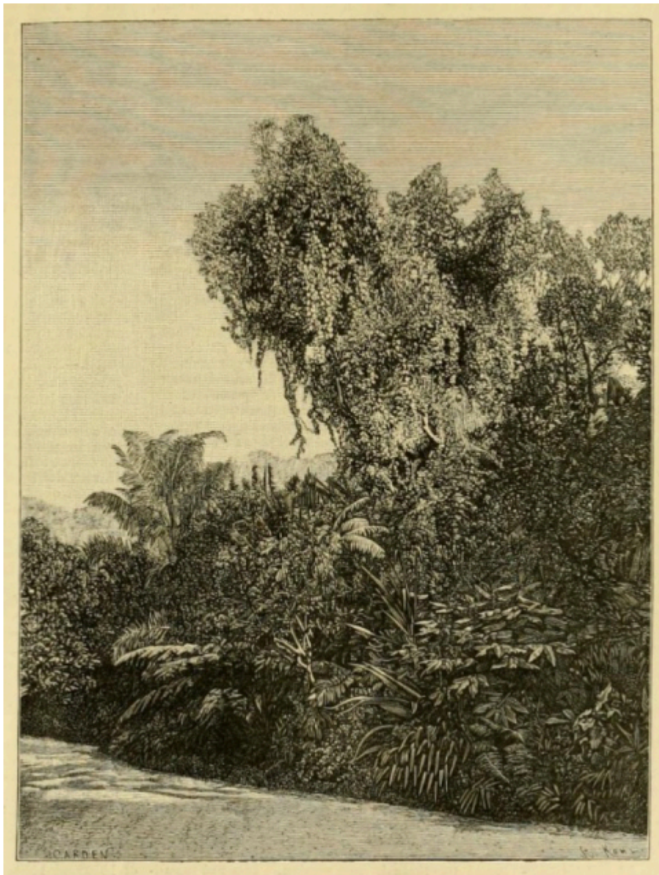
'View in the garden of the Villa Montboron. Old Olive tree 15 feet high, covered with Passion flowers, Tropaeolums, and Roses. Engraved for The Garden ', Armand Kohl (engraving). Illustration for William Robinson, 'Gardens around Nice', The Garden 29(760), Jun 12, 1886: 542-543.