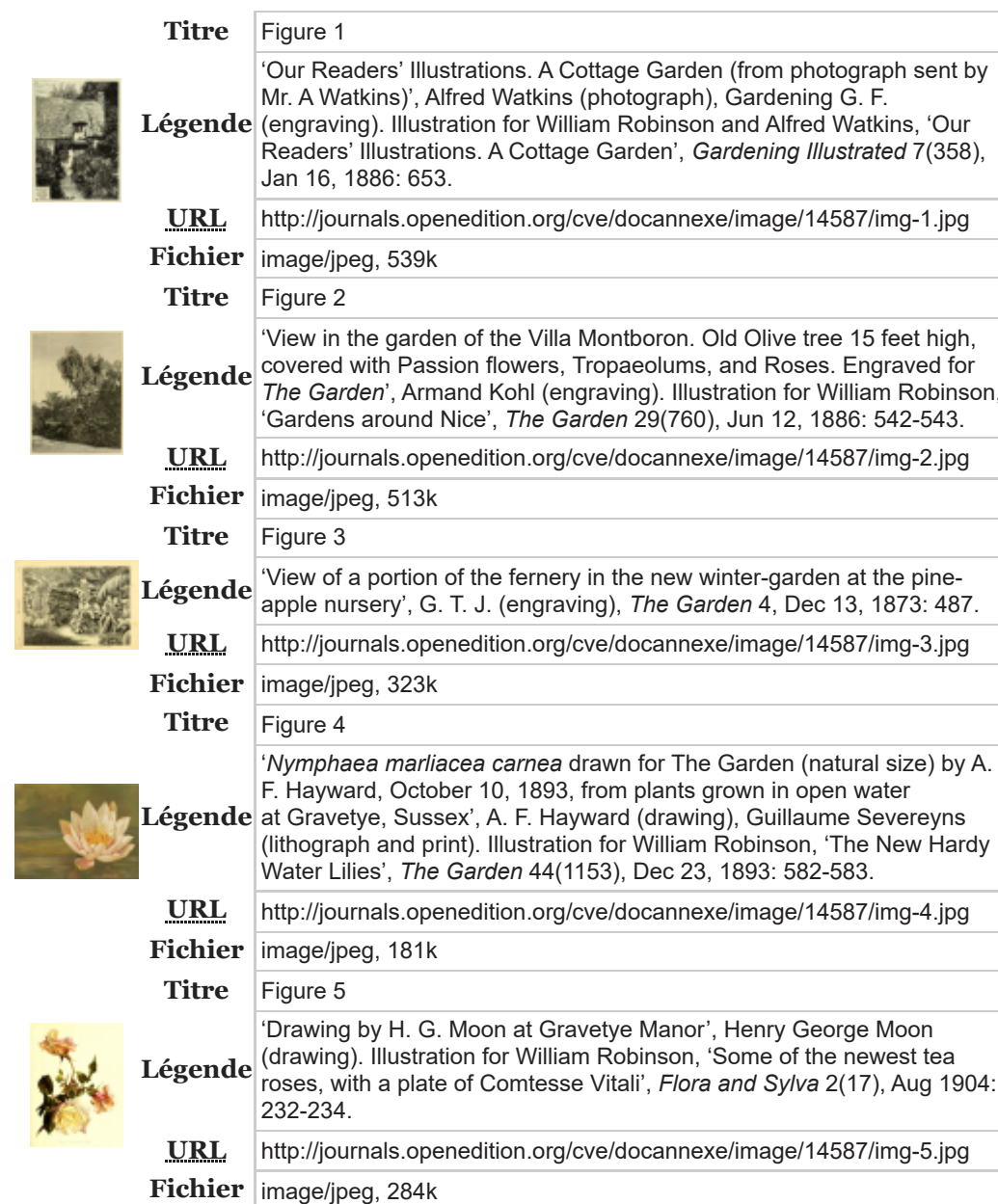
Table des illustrations

9 Namely Gardeners' World (1968–today) on BBC Two, Beechgrove Garden (1978–today) on BBC Scotland and Love your Garden (2011–2021) on ITV.