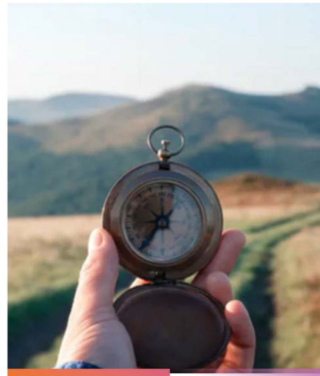
FIGURE 5 Symbolic level: access to treatment as a quest.

patients around these strategies and, once the treatment is prescribed, to accept the perceived risk (Figure 5).