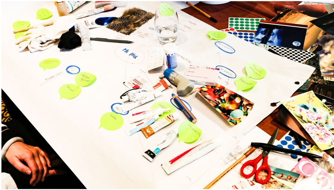
FIGURE 3 Photography_Collection AFA 2021 'AD series' n°3 - Courtesy S. Diochon.

The different stages of the care pathway, associated with the difficulties encountered in accessing a new treatment, are mentioned below and accompanied by a few direct quotes from patients: