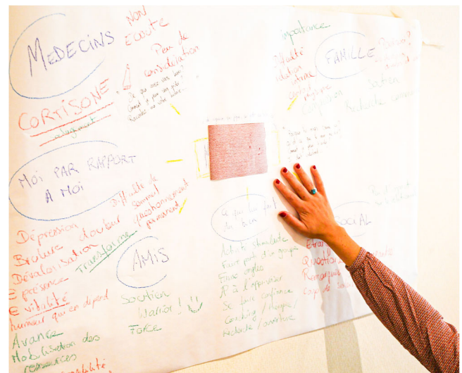
FIGURE 6 Photography_Collection AFA 2021 'AD series' n°4

The study used an innovative methodology, focused on co-design with patients, based on understanding their experiences from affect narratives, the specific study of emotional communication from the perspective of the approach the anthropological. The VECUDA study adopted a multidisciplinary approach by bringing together a scientific committee of experts composed of two dermatologists, two anthropologists, and a sociologist. The exploratory qualitative method reduced bias by providing a series of creativity tools to encourage patients to express their feelings while respecting their experience and adding topics for discussion, thereby reducing bias in the elaboration of results. However, the main biases of this part of the study, which coincidentally brought out the level of symbolic understanding of the patient figure seeking a new treatment, was the low number of patients concerned in the pattern, that is, 8 patients out of 24 in total. Six were on bioterapy, while two were still seeking a new treatment. These significant results attracted our