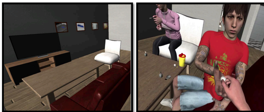
Fig. 1. First Person View in Neutral VR and Cocaine VR Conditions.