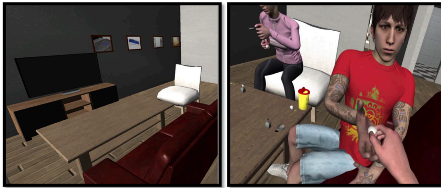
Fig. 1. First Person View in Neutral VR and Cocaine VR Conditions.