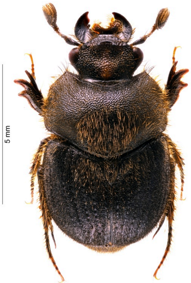
Fig. 1. Nothochodaeus lycaon n. sp., ♂ holotype.

The specimen described in the frame of this study was compared with other Filipino, Indonesian and Malaysian species deposited in the Muséum national d'Histoire naturelle, Paris, France (MNHN), and in the author's private collection (CJBH).