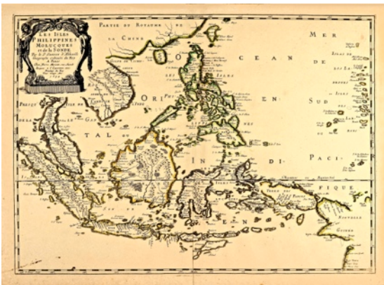
Illustration de la couverture :

Old map of The Philippines, Moluccas and Sunda Islands.