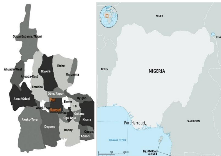
Figure 1:Map of Rivers State (Nigeria)

region of Nigeria's Niger Delta, holds historical significance, having been part of the former Eastern Region before gaining autonomy in 1967. Geographically, it shares borders with Imo and Anambra to the north, Abia and Akwa Ibom to the east, and Bayelsa and Delta to the south, with the Atlantic Ocean marking its southern limit. Its landscape ranges from level plains crisscrossed by numerous rivers to tributaries. The state's population was 5,198,716 according to the 2006 census and had increased to 7,492,366 by 2023, making it the seventh most populous state in Nigeria.