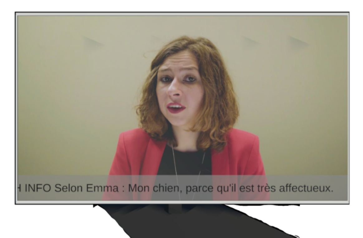
Figure 2. The two virtual screens. On the left, the computer screen with the task to be carried out; On the right, the virtual television, which broadcasts some of the participant's responses.

In progress: Viability study with 3 research questions