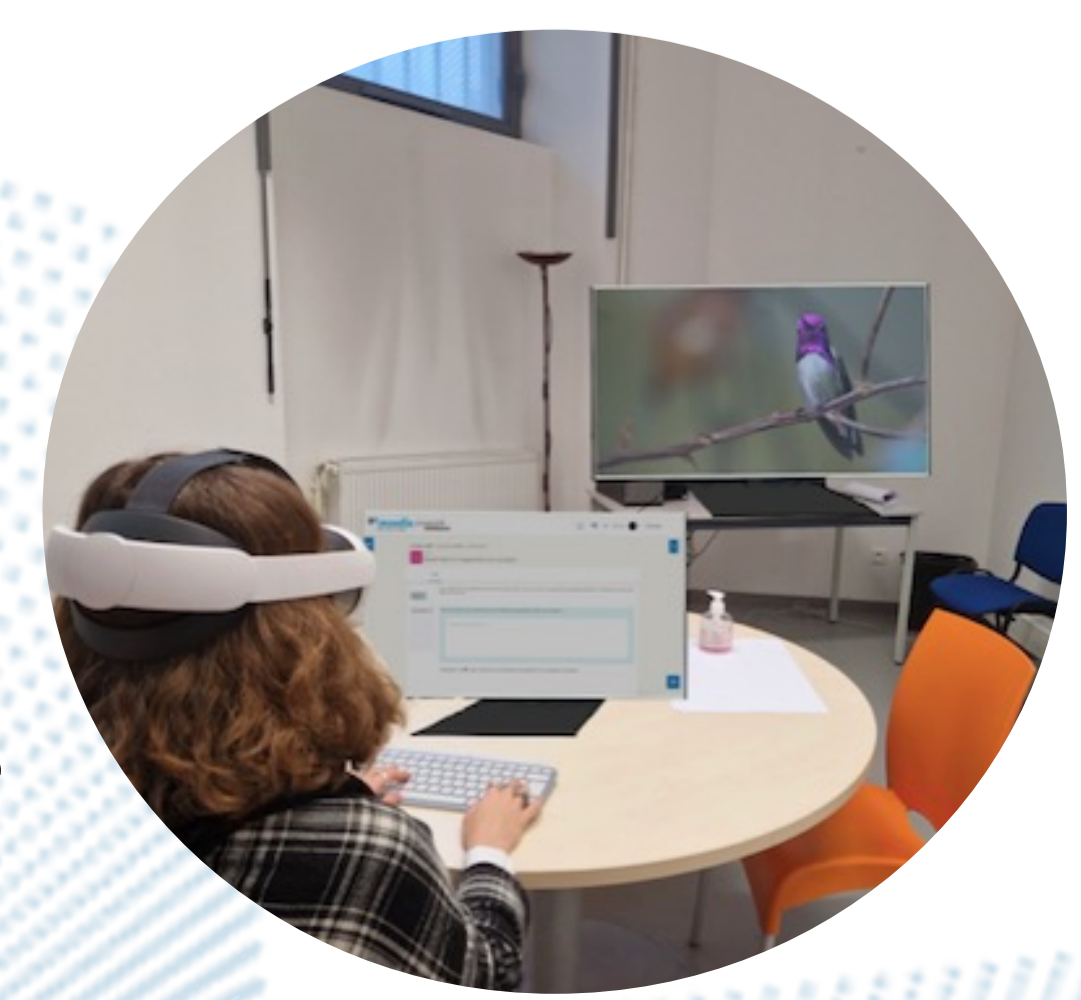
Figure 3. A student testing the AR device. She must complete a task on a virtual computer (homework) while experiencing symptoms of schizophrenia.

If the viability study is positive, to go further: Future research will focus on testing the simulation in terms of training and destigmatizing efficacy .