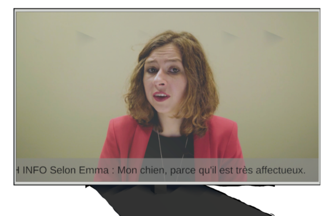
Figure 2. The two virtual screens. On the left, the computer screen with the task to be carried out; On the right, the virtual television, which broadcasts some of the participant's responses.

In progress: Viability study with 3 research questions