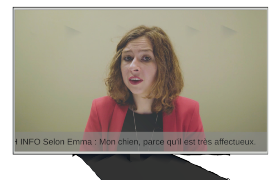
Figure 2. The two virtual screens. On the left, the computer screen with the task to be carried out; On the right, the virtual television, which broadcasts some of the participant's responses.

In progress: Viability study with 3 research questions