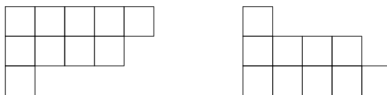
FIGURE 2. The Young diagram of the partition (5, 4, 1) , in the English convention (on the left), and the French convention (on the right).

2.1. Definitions and main properties. Before going into the study of the measure \mathcal{U}(q) , we recall some well-known facts about integer partitions. An integer partition 1 \alpha \vdash n of size n is a finite family of integers \alpha = (\alpha_1, \dots, \alpha_{\ell(\alpha)}) \in \mathbb{N}^{\ell(\alpha)} with \alpha_1 \geq \dots \geq \alpha_{\ell(\alpha)} > 0 , |\alpha| := \alpha_1 + \dots + \alpha_{\ell(\alpha)} = n . The integers \alpha_1, \dots, \alpha_{\ell(\alpha)} are called the parts of the partition and \ell(\alpha) is called its length . We denote by \mathfrak{Y}_n the set of partitions of size n , and \mathfrak{Y} = \bigsqcup_n \mathfrak{Y}_n the set of all integer partitions. A partition \alpha \vdash n is usually represented by a Young diagram , which is a collection of n boxes in \ell(\alpha) left-justified rows, where the i -th row contains \alpha_i boxes. An example is displayed in Figure 2 below. In this representation, each box is labelled