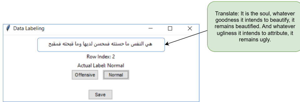
Figure 1. A data labelling simple program designed to check the correctness of data samples. The interface displays the actual label and row index to track progress. It includes three buttons: one for changing the label to "offensive," another for changing it to "normal," and a "save" button to save the new version to a CSV file.