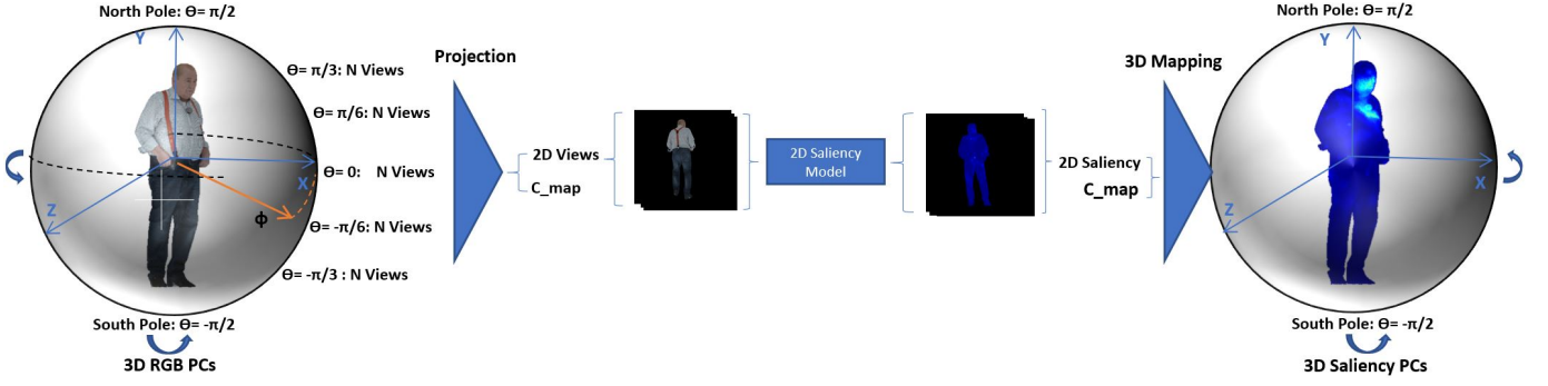
Fig. 1. A High-Level Overview of Our Proposed Framework: Illustrating the Core Workflow and Key Components

R around the principal axes ( x, y, z ), adjusting the orientation in 3D space. This process is mathematically represented as: