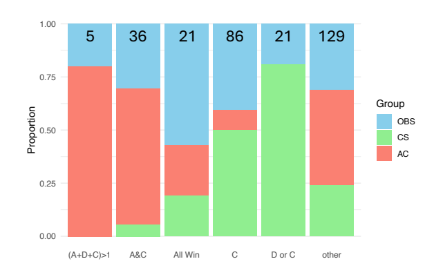
Figure 3: Most common rules inferred by the participants. The numbers in the bars represent the total number of participants in each group.

or AC conditions. A three-way ANOVA confirmed that the difference between the means of each condition was highly significant (Df = 2, t = 15.65, p < 4e-07).