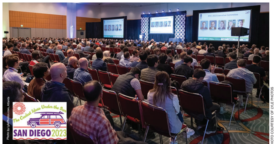
Figure 1. RFIC 2023 plenary session.

Following the full day of Sunday workshops, the RFIC plenary session (see Figure 1 for a photo of the 2023 plenary session) will be held in the evening, beginning with conference highlights and the presentation of the Student Paper Awards and the Industry Best Paper Awards. The RFIC plenary session will conclude with two visionary plenary talks: