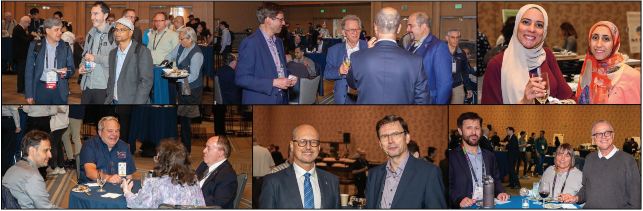
Figure 3. Various attendees of our 2023 “Reviewers Recruiting and MTT-S Journals Reception” at IMS San Diego enjoying the evening.

some reviewing for one or more of our sponsored journals over the coming 12 months. You can sign up for a ticket by using the link at the end of the article. We will require some details on your areas of expertise, affiliation, and experience level to properly place you in our reviewing pools, so please respond to all the questions on the sign-up form. Once the form is submitted, you will receive an entry ticket via the e-mail address you provide. Please print this ticket or keep it handy on your