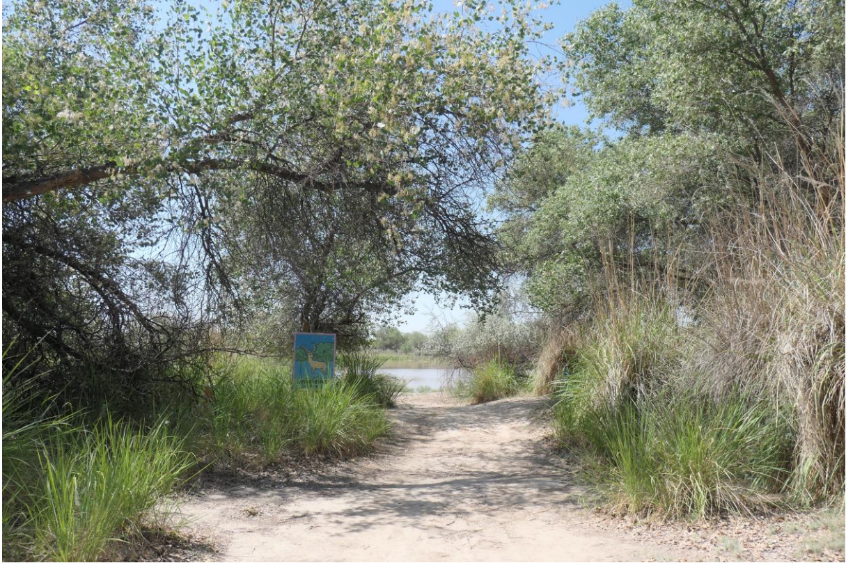
Figure 2. Tugai and Amu Darya river in LABR (Bagai-Tugai). Picture: Camille Rhoné-Quer, July 2023.

On the other hand, we do not know where exactly Mas'ūd hunted: was he on the left bank, the right bank, or on the island of the prophet (Aral Payghambar)? Are there any hunting enclosures in the area? Whatever the answer, it is highly likely to be an area of tugai and reedbeds (FIGURE 2), as this ecosystem is suitable for both tigers and lions [10, P.6b]: the riparian forests provide easy access to water and their vegetation is home to many other mammals such as wild boar and Bukhara red deer (FIGURE 3), which are prized by both felines. In fact, the sultans also hunted other animal species. These animals, described without further precision as "game", ( dīgar šikār-hā ; ṣayd ) are edible: they are eaten by the sultan but perhaps also offered at the banquet given the next day at Termez [3, I P.285-286; tr. I P.342-343].