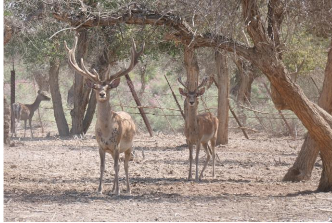
Figure 3. Bukhara Red deer in LABR. Picture: Camille Rhoné-Quer, July 2023.