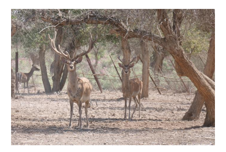
Figure 3. Bukhara Red deer in LABR.