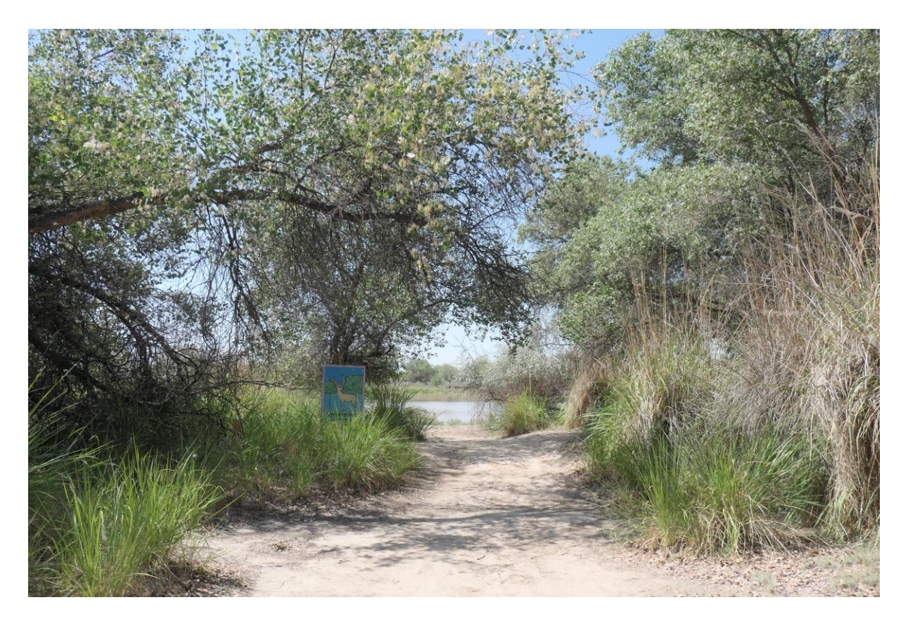
Figure 2. Tugai and Amu Darya river in LABR (Bagai-Tugai). Picture: Camille Rhoné-Quer, july 2023.

On the other hand, we do not know where exactly Mas'ūd hunted: was he on the left bank, the right bank, or on the island of the prophet (Aral Payghambar)? Are there any hunting enclosures in the area? Whatever the answer, it is highly likely to be an area of tugai and reedbeds (FIGURE 2), as this ecosystem is suitable for both tigers and lions [10, P.6b]: the riparian forests provide easy access to water and their vegetation is home to many other mammals such as wild boar and Bukhara red deer (FIGURE 3), which are prized by both felines. In fact, the sultans also hunted other animal species. These animals, described without further precision as "game", ( d\bar{r}gar \, sik\bar{a}r-h\bar{a}; \, sayd ) are edible: they are eaten by the sultan but perhaps also offered at the banquet given the next day at Termez [3, I P.285-286; tr. I P.342-343].