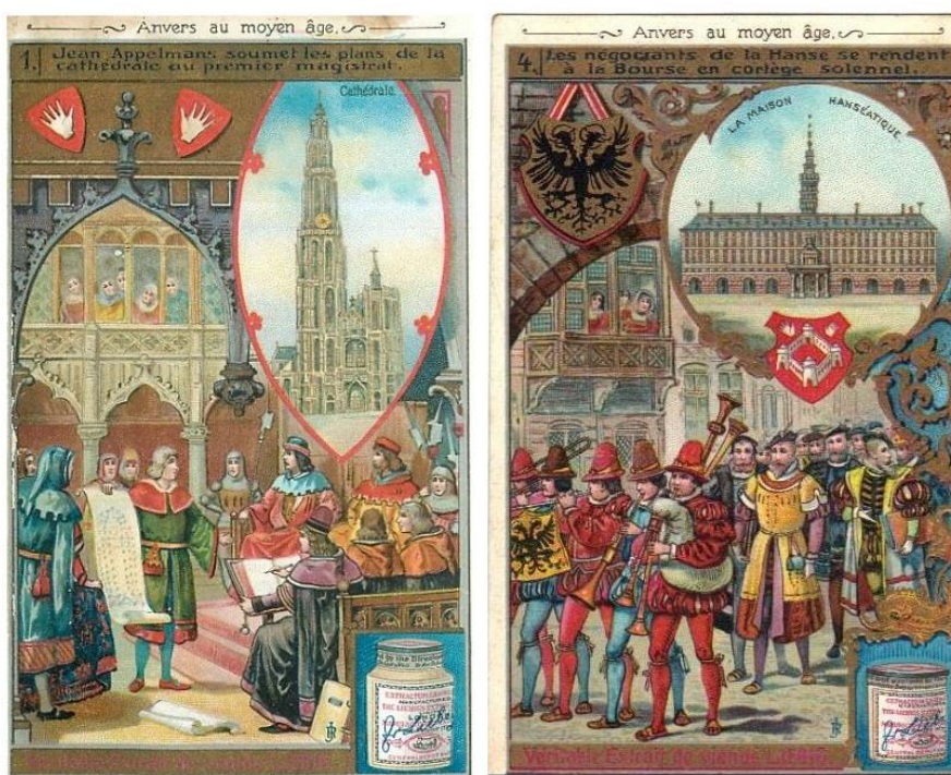
Plate 5. Two chromolithographs of Antwerp's history by Liebig – 1. “Jean Appelmans submits the plans of the cathedral to the first magistrate”. 2. “The Hanseatic merchants go to the Stock Exchange in a solemn procession”.

chromolithographs, as in other images produced by Liebig, we notice less personified historical scenes. The images represent groups of men rather than portraying only a monarch or a hero (cf. plate 5).