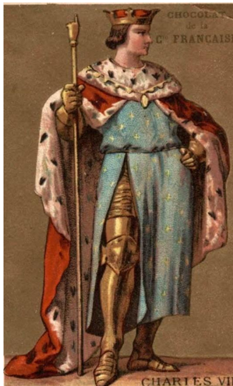
Plate 1. Portrait of Charles VII by La Compagnie française

The story we are told focuses on the ruling and warrior elite. 36% of the chromolithographs in the sample represent rulers and 21% warriors. Only 12% of the images represent the general population (peasants, merchants, craftsmen). Some companies, like the chocolate factory La Compagnie française , mainly published chromolithographic portraits of sovereigns (cf. plate 1).