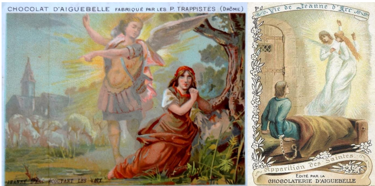
Plate 4. Two chromolithographs of Joan of Arc by Aiguebelle – 1. “Joan listening to voices”. 2. “The apparition of the Saints”.

Saint Margaret and Saint Catherine alone did not abandon her. They appeared to her, advised her and comforted her with sweet words, telling her to respond boldly to her tormentors and fear only God - "Apparition of the Saints" by Aiguebelle Chocolate factory.