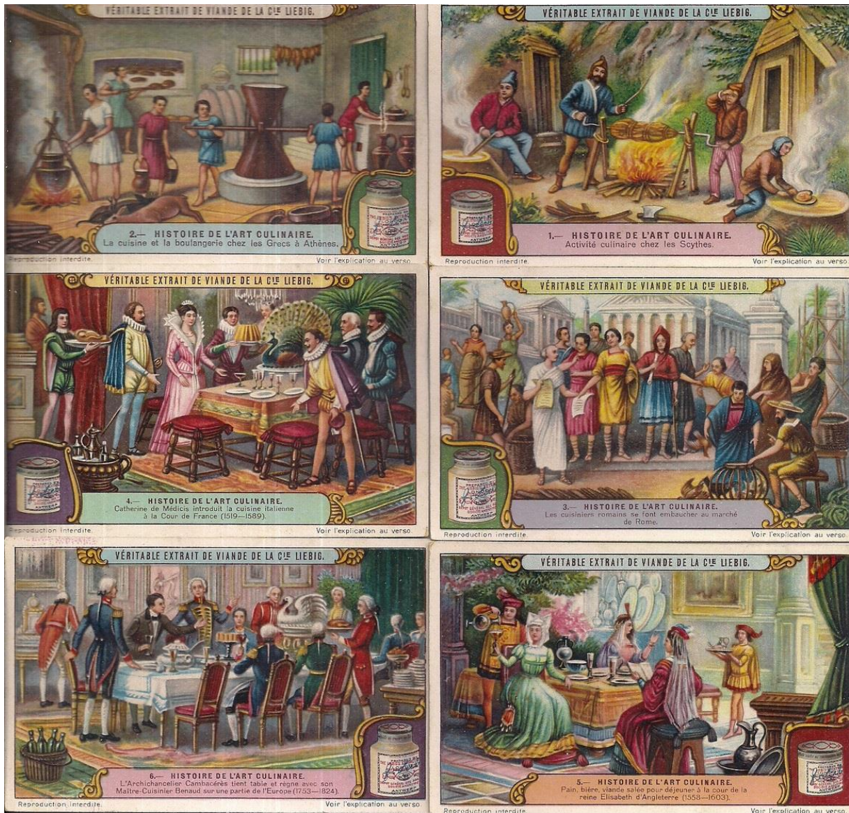
Plate 6. "The History of Culinary Arts", Six chromolithographs by Liebig. Author's personal collection

Furthermore, Liebig's chromolithographs are devoid of any religious celebration or condemnation. When a religious building is presented, it is in relation to its architecture and the history of its construction. Liebig also manages to break away from the nationalism of his time by dealing more with ancient history (24% of the sample, against 13% for the competitors) and by borrowing a more erudite and encyclopedic style: