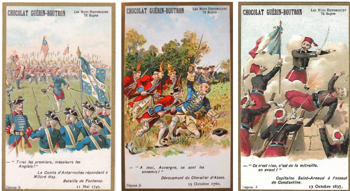
Plate 2. Three chromolithographs with quotes by Guérin-Boutron – 1. “Shoot first, English gentlemen”, The Count of Anterroches responding to Milord Hay, Battle of Fontenoy, May 11, 1745. 2. "To me, Auvergne! Here is the enemy!" Dedication of the Knight of Asses,

The Guérin-Boutron chocolate factory produced a series of chromolithographs conveying these, occasionally, apocryphal quotes. Through these words, the military, courage and patriotism are celebrated (cf. plate 2).