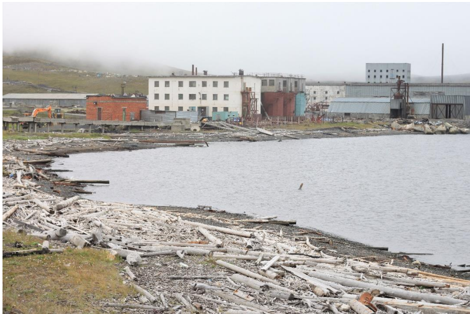
Tiksi's coastline.

We also took the time to enjoy the view from the foggy coastline.