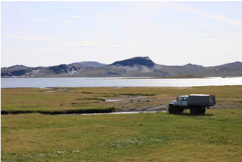
Sightseeing the tundra.

During our stay, the Head of the Ministry of Nature's Protection also invited us to sightsee the tundra with him and pick some mushrooms, like locals do.