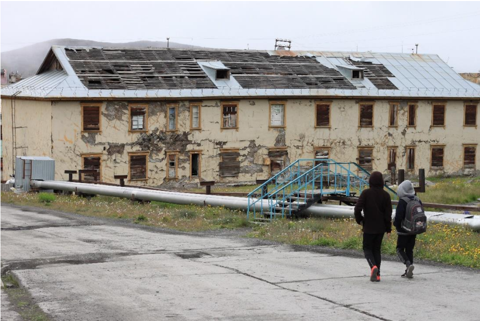
Kids walking around Tiksi.

After finishing with our daily meetings, we enjoyed going for a walk to discover new spots around the area. We climbed the well-known hill from where we had a unique view of the entire territory.