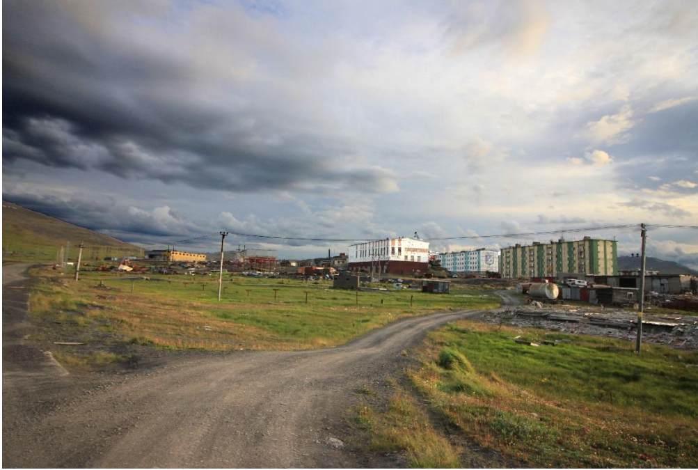
Streets of Tiksi.