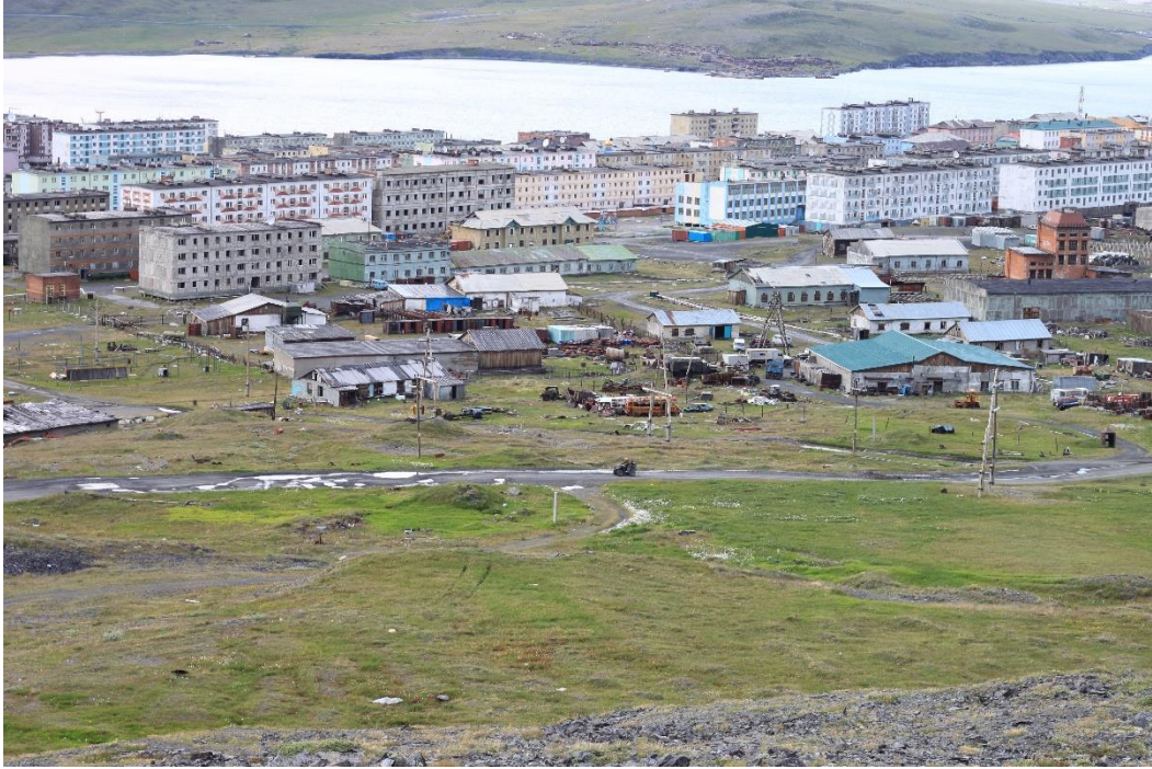
View of Tiksi from the hill.

We also took the time to enjoy the view from the foggy coastline.