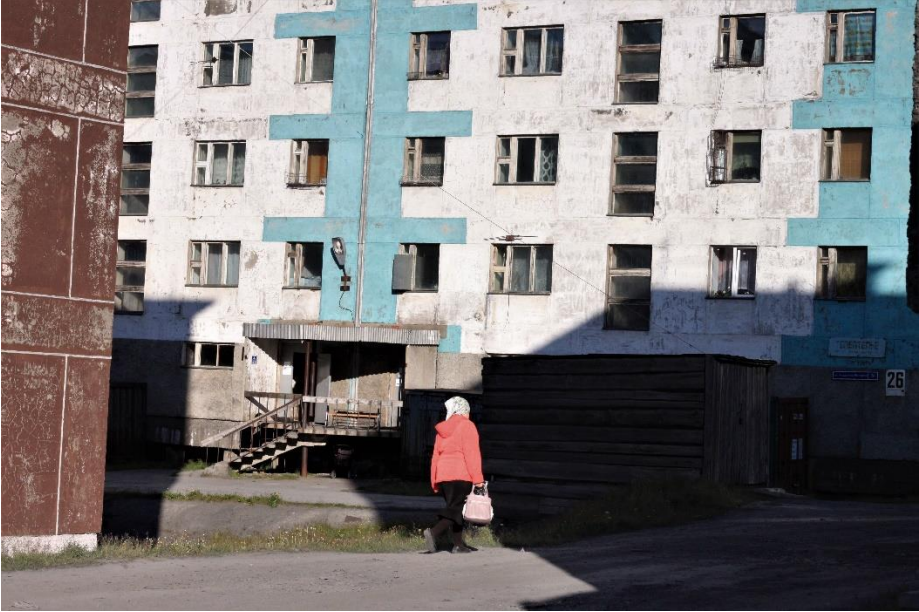
Woman walking down the streets of Tiksi.

Authorities, from their side, manifested their interest in our research topic and provided us their support all along our fieldwork. They kindly offered us the meeting rooms of the administration building to conduct our interviews.