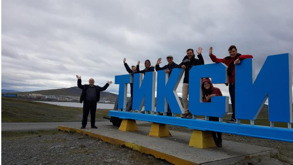
The Head of the Bulunsky District is bidding us farewell as we leave Tiksi.