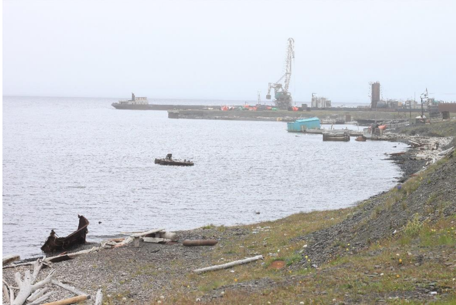
Tiksi's coastline.

During our stay, the Head of the Ministry of Nature's Protection also invited us to sightsee the tundra with him and pick some mushrooms, like locals do.