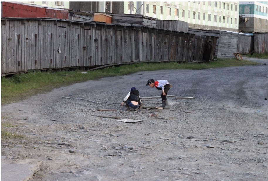
Kids playing in the streets of Tiksi.

The main objective of this fieldwork was to meet local inhabitants in order to identify if they perceive permafrost thaw as a risk, and if so, which dimensions of their lives are currently being impacted and at what scale.