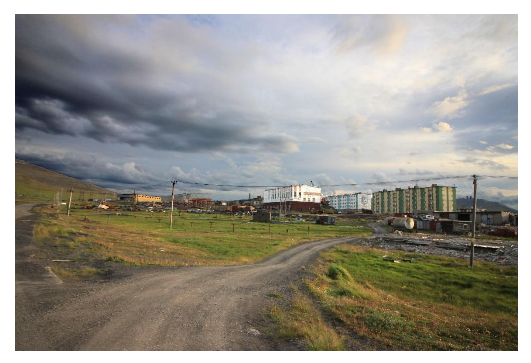
Streets of Tiksi.