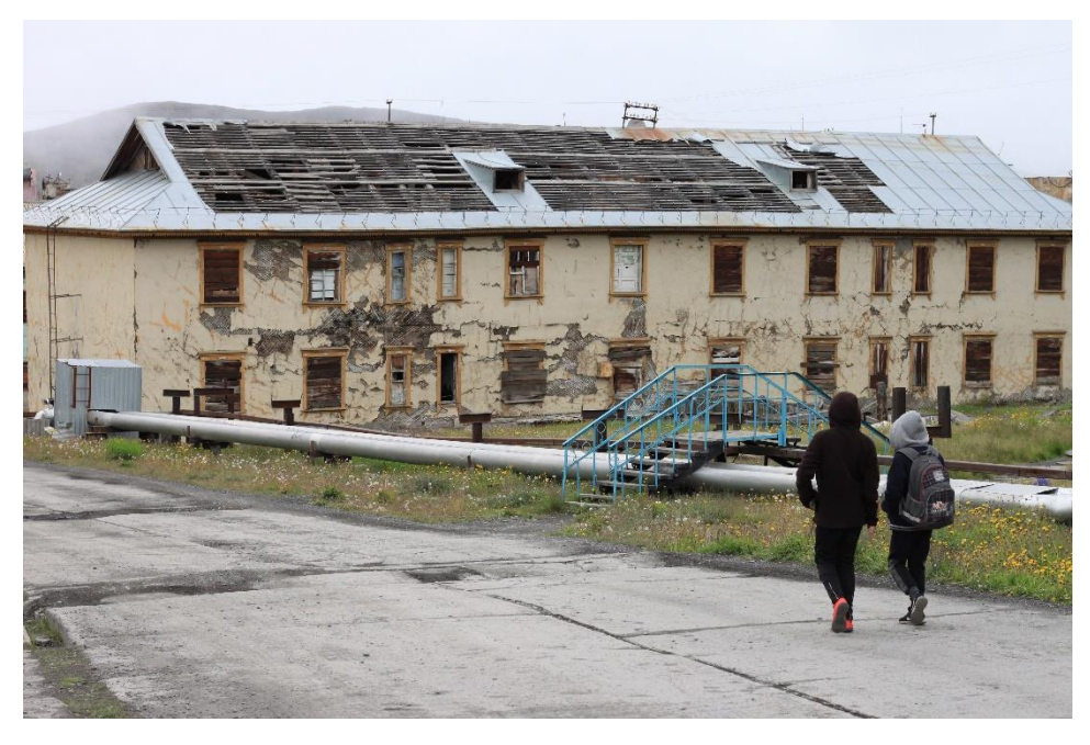
Kids walking around Tiksi.

After finishing with our daily meetings, we enjoyed going for a walk to discover new spots around the area. We climbed the well-known hill from where we had a unique view of the entire territory.