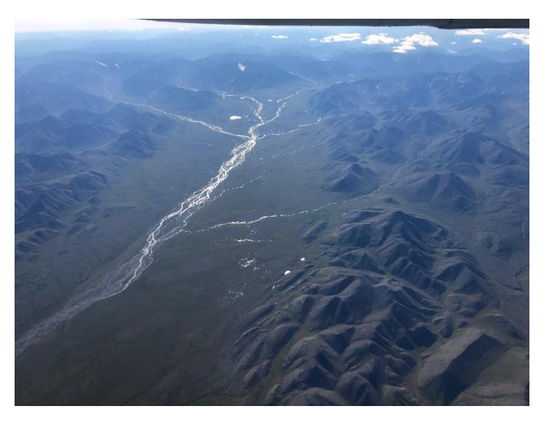
View from the plane – on route to Tiksi.

During the 2h50 of flight, we had the opportunity to delight ourselves with an incredible view of Yakutia from the sky.