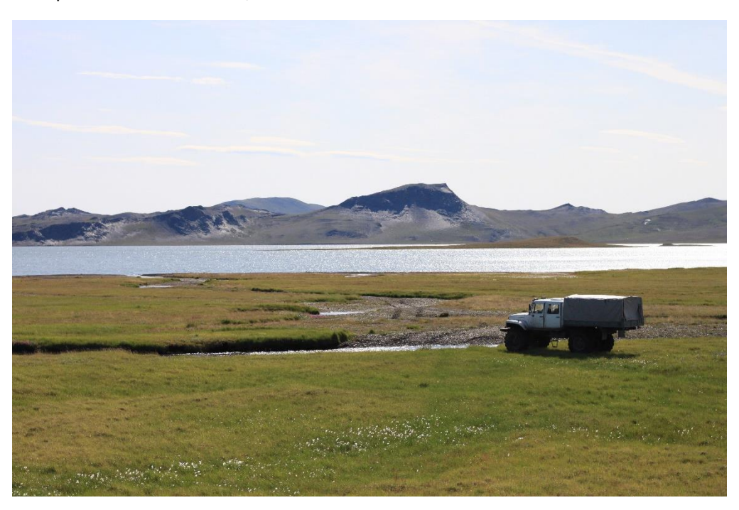
Sightseeing the tundra.

During our stay, the Head of the Ministry of Nature's Protection also invited us to sightsee the tundra with him and pick some mushrooms, like locals do.