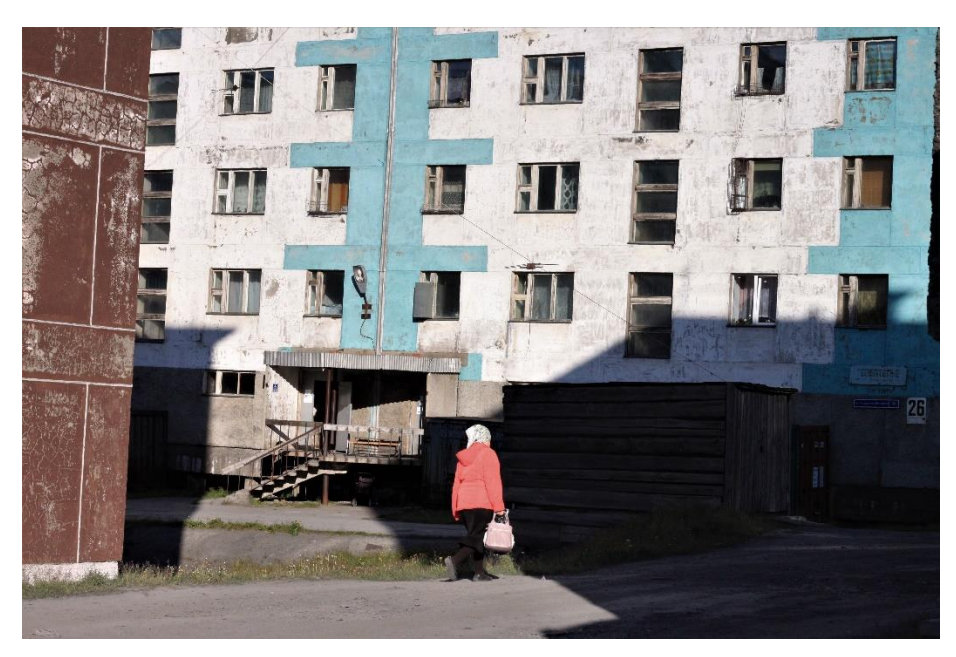
Woman walking down the streets of Tiksi.

Authorities, from their side, manifested their interest in our research topic and provided us their support all along our fieldwork. They kindly offered us the meeting rooms of the administration building to conduct our interviews.