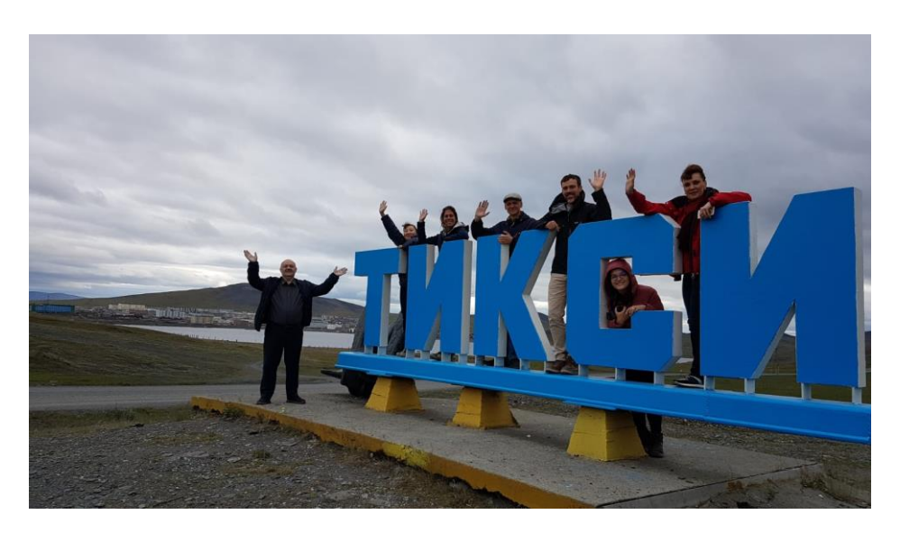
The Head of the Bulunsky District is bidding us farewell as we leave Tiksi.