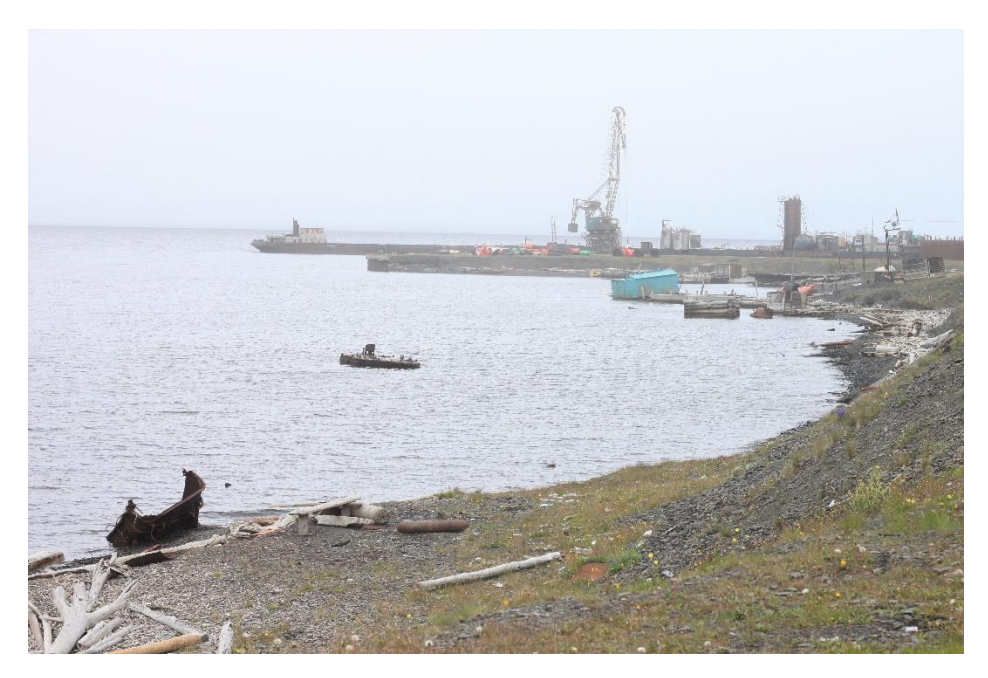
Tiksi's coastline.

During our stay, the Head of the Ministry of Nature's Protection also invited us to sightsee the tundra with him and pick some mushrooms, like locals do.