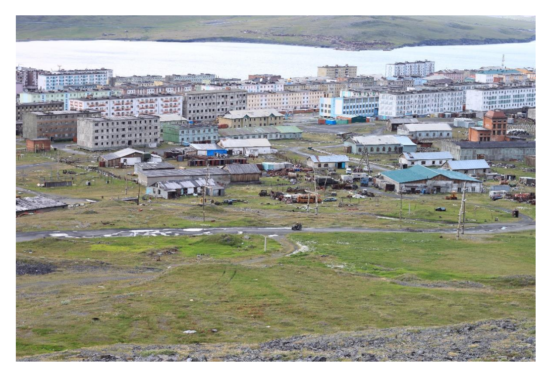
View of Tiksi from the hill.

We also took the time to enjoy the view from the foggy coastline.