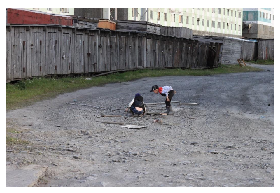
Kids playing in the streets of Tiksi.

The main objective of this fieldwork was to meet local inhabitants in order to identify if they perceive permafrost thaw as a risk, and if so, which dimensions of their lives are currently being impacted and at what scale.