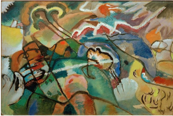
Sketch II for Painting with White Border ( Entwurf II zu Bild mit weißem Rand, Moskow ), 1913, oil on cardboard, 70 x 104 cm, Saint-Petersburg, The Russian Museum.

Kandinsky's technique is in itself spiritual, as he consciously veils the object and the meaning through little touches. Here such touches are distinguishable in the different spots in the middle (by the use of what is called a 'squashing technique'), 63 but also through the veiling of the white border. Together with the 'sound' of the colour white, the white veiling below shows the full possibility of the origins towards the white veiled dimension at the upper left corner that manifests the divine eschatology of the ends, through a circular process that introduces time into the painting. This is a device often used by the artist. From the origins to the end, therefore, the viewer walks on the same spiritual path experienced by the artist.