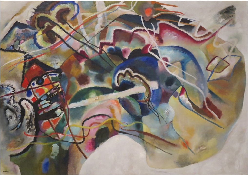
Painting with White Border ( Bild mit weißem Rand (Moskow) ), 1913, oil on canvas, 140.3 x 200.3 cm, New York, Solomon R. Guggenheim Museum.

progressively led him to discover the meaning of his art. Moscow at sunset, before the final uniformity of red, magnifies all colours in a symphony where each possesses its own vibration at its highest level. 49 Two later paintings Moscow I and Moscow II exemplify this feeling. 50 Nonetheless, the title of the painting, together with the two later more figurative paintings about Moscow, should not mislead us. Whereas Moscow I and II evoke the 'joy of life and the universe', 51 Painting with White Border is built differently. 52