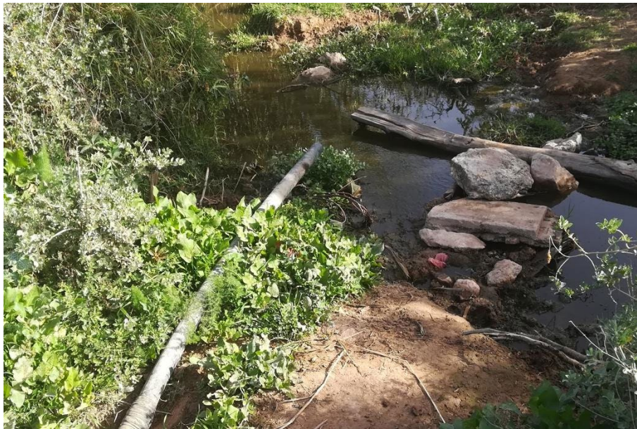
Figure 3. Informal irrigation with treated wastewater in Attebane, downstream of the Tiznit treatment plant.