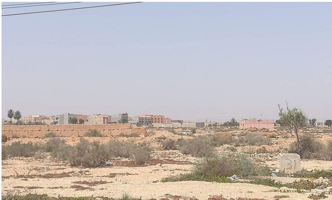
Figure 4. Fallow area in TargaNzit, which has officially been part of the TWWRI project since 2006.

As a consequence, many local farmers lost interest in the TWWRI project; some, to make their disagreement clear, simply refused to have irrigation hydrants installed on their land. Immediately outside the city walls, some landowners began to subdivide their land illegally to build sports facilities, campsites for tourists, and a festival hall. Faced with this reluctance, the president of the AUEA tried, 'plot by plot', to convince each farmer to participate, (Goeury and Leray, 2017); however, he felt unable to guarantee the lasting operation of drip irrigation in the entire projected scheme. This was a problem because, under national regulations, the AUEA has a legal responsibility to maintain the equipment in good condition for at least eight years. Understandably, the president refused to include farmers whom he was not confident would irrigate. Instead, he proposed to start by equipping only the 54 ha that belonged to farmers who had confirmed their interest in the project. As the DPA refused, preferring to stick to the original target of 284 ha in the area, the conflict remained unresolved; it paralyses the project to this day and a large part of the area still lies fallow (see Figure 4).