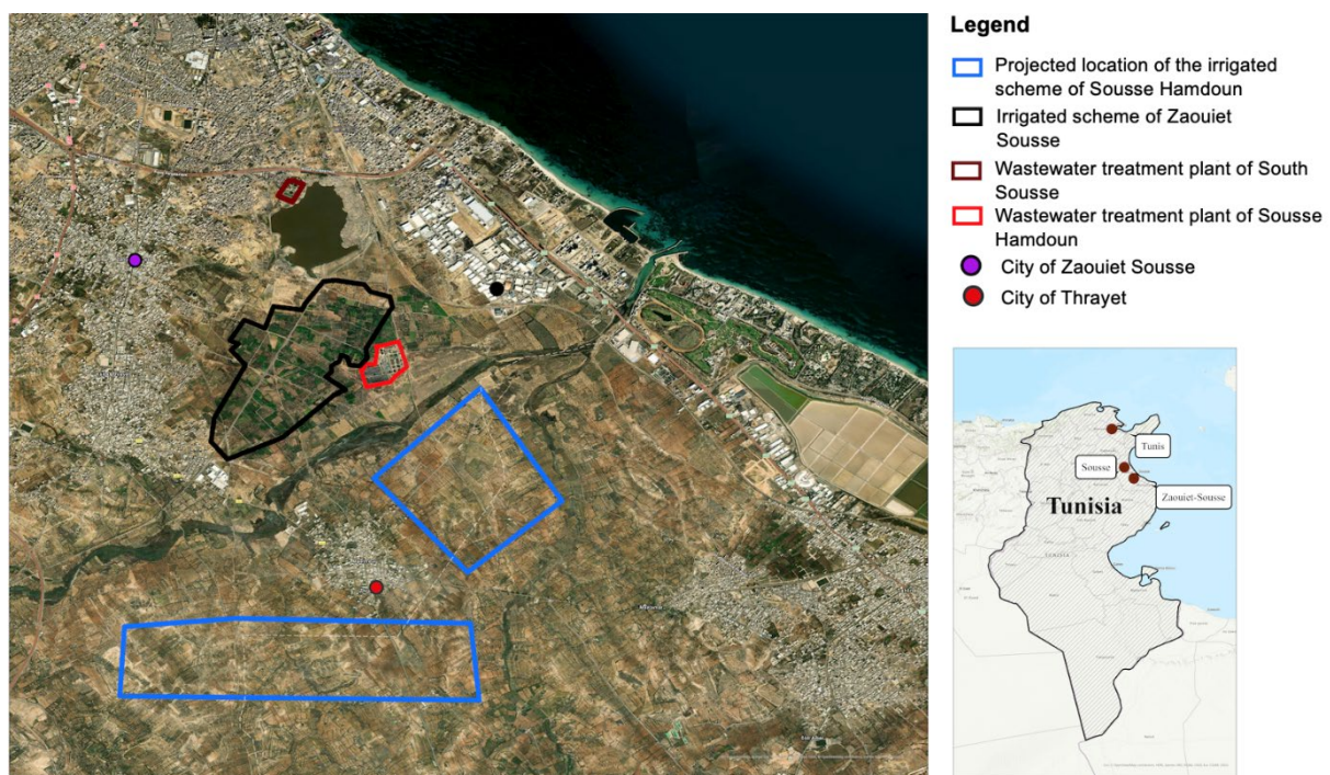
Figure 1. Existing scheme in Zaouiet Sousse and projected scheme in Sousse Hamdoun, Tunisia.