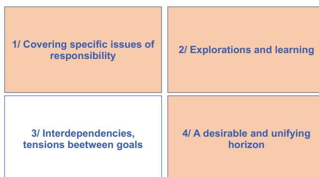
Figure 3 Results of the coding in terms of valid propositions according to the purpose model