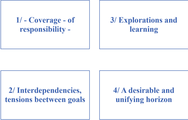
Figure 1 Overview of the proposed purpose model