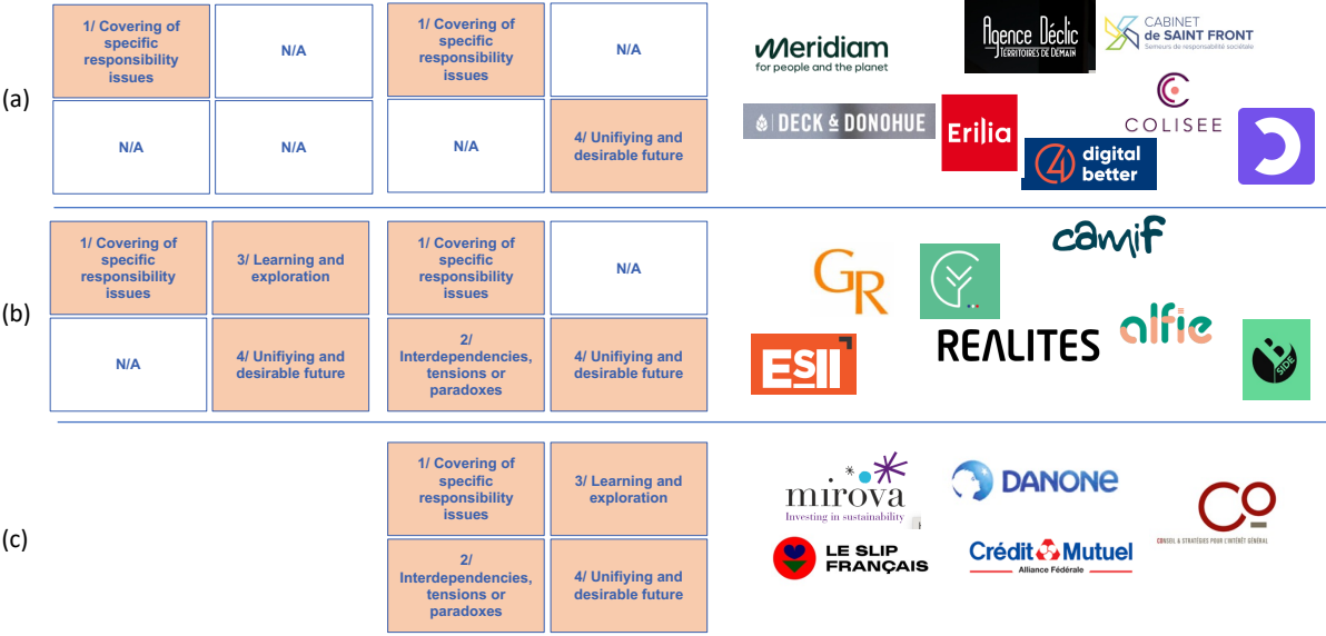
Figure 9 Results expressed through the three configurations (overview - sample A)

If we perform this classification, we reveal a contrasting reality in terms of the content of commitment (Figure 9). In other words, we find companies across all three configurations on one hand, and on the other hand, we confirm the mobilization of purpose as a tool for commitment towards Grand challenges with configurations (b) and (c). This work also highlights that attributes (3) Learning and Explorations and (4) Interdependencies are massively less represented than the other two, which are almost systematically found in the formulations.