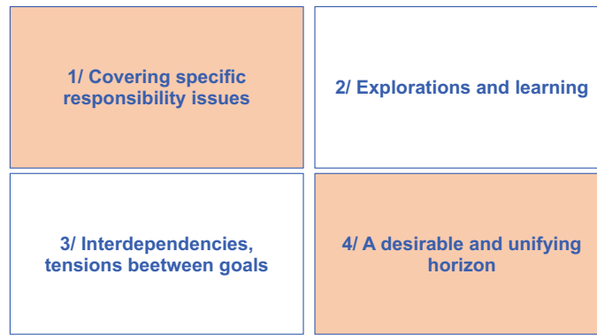
Figure 4 Results of the coding (Colisée case)