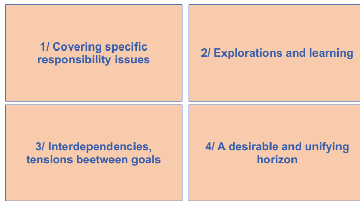
Figure 5 Result of the coding (Danone case)