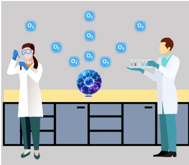
Fig. 1 A laboratory plasma device releases ozone into the ambient air