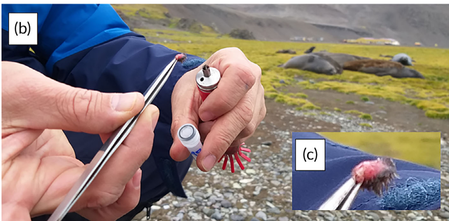
FIGURE 2 Sampling collection of southern elephant seals ( Mirounga leonina ) using the PAXARMS remote biopsy system in the Antarctic Specially Protected Area (ASPA) 132, Isla 25 de Mayo/King George Island, South Shetland Islands (western Antarctic Peninsula). (a) The red dart is located within the yellow circle next to an individual after sampling collection. (b) Skin and blubber sample collected with the dart. (c) Detailed photograph of the sample collected, in which skin with some hairs attached is observed; however, only skin without attached hair was used to conduct mercury analysis.

Baker, 2012). Sixty skin samples from 30 adult females and 30 subadult males were collected, preserved in 70% ethanol, and stored at -20^{\circ} C until laboratory analysis (Figure 2). Following the age classification parameters of the Laboratory of Marine Mammals from Argentine Antarctic Institute, sex and age class were determined by visual inspection of external characteristics and body size was estimated for each individual sampled.