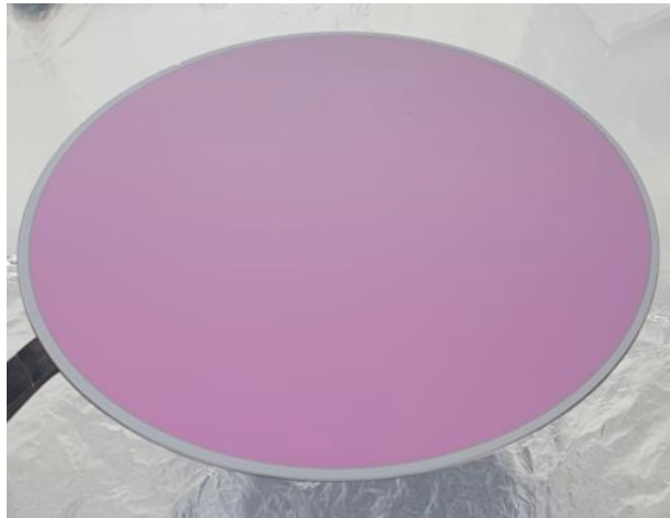
Figure 2. GaN-based heterostructure for integrated photonics grown by molecular beam epitaxy with a Riber R49 reactor on a Si 200 mm diameter substrate. The uniform color indicates an excellent thickness uniformity (below \pm 1\% ). The surface roughness (rms) is 0.7 nm.

The III-nitrides can be epitaxially-grown on large wafer sizes. Figure 2 shows an example of a III-nitride layer for integrated photonics and photonic crystal fabrication grown on a 200 mm diameter silicon substrate. The most standard wafers are sapphire and silicon but homoepitaxy on GaN substrate is also available, in particular when the dislocation density is a critical parameter. In the case of silicon(111), growth on 300 mm substrates has been demonstrated. Wafer-scale manufacturability is not an issue with these materials.