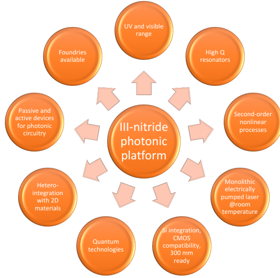
Figure 1. Summary of the main opportunities offered by the III-nitride materials for a photonic platform.

technology, it does not rule out the interest of other methods, like molecular beam epitaxy, depending on the targeted applications.