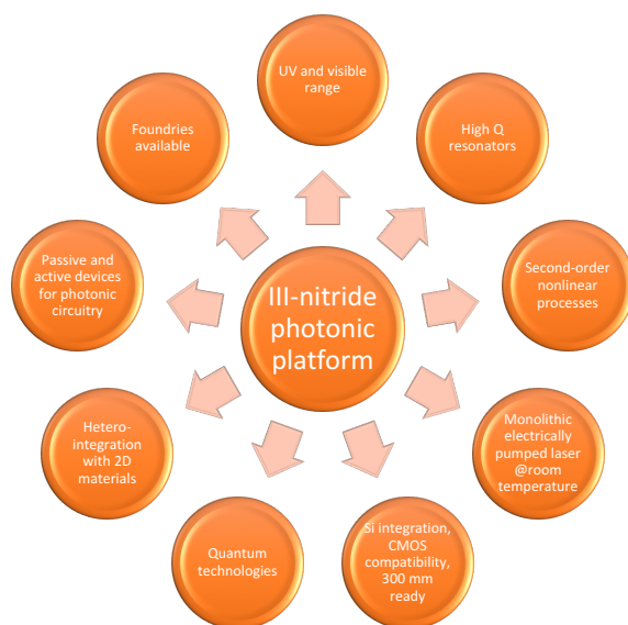
Figure 1. Summary of the main opportunities offered by the III-nitride materials for a photonic platform.

technology, it does not rule out the interest of other methods, like molecular beam epitaxy, depending on the targeted applications.