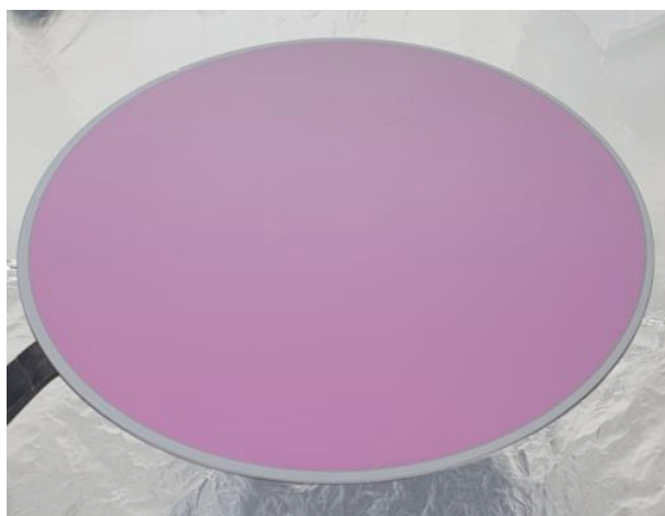
Figure 2. GaN-based heterostructure for integrated photonics grown by molecular beam epitaxy with a Riber R49 reactor on a Si 200 mm diameter substrate. The uniform color indicates an excellent thickness uniformity (below \pm 1\% ). The surface roughness (rms) is 0.7 nm.

The III-nitrides can be epitaxially-grown on large wafer sizes. Figure 2 shows an example of a III-nitride layer for integrated photonics and photonic crystal fabrication grown on a 200 mm diameter silicon substrate. The most standard wafers are sapphire and silicon but homoepitaxy on GaN substrate is also available, in particular when the dislocation density is a critical parameter. In the case of silicon(111), growth on 300 mm substrates has been demonstrated. Wafer-scale manufacturability is not an issue with these materials.