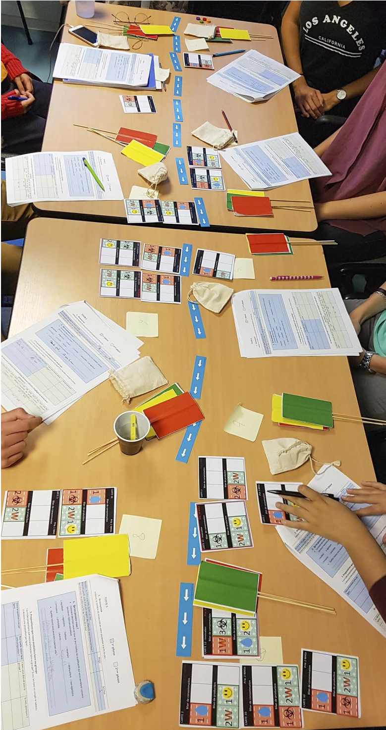
Figure 11.3. CappWAG, a tool for assessing learning and skills