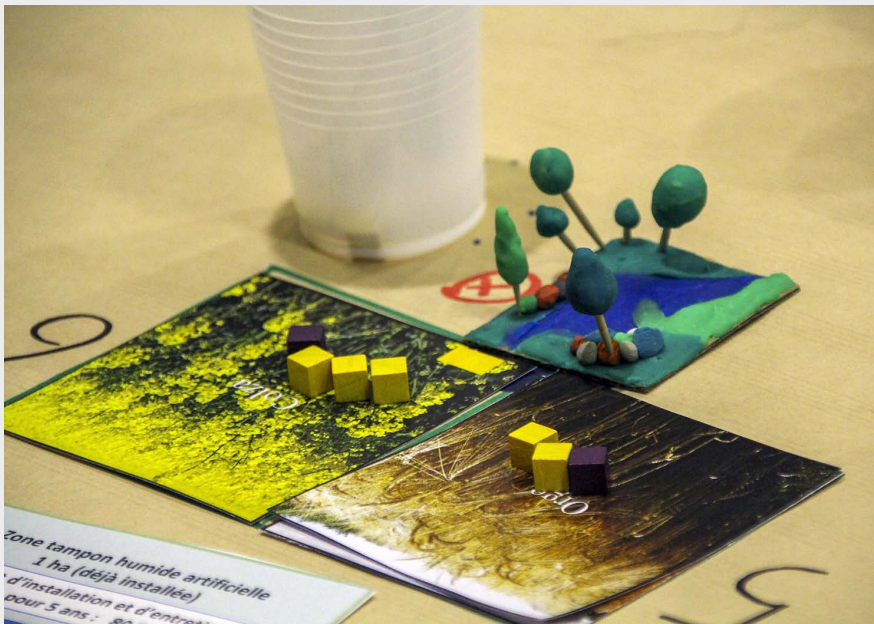
Figure 11.2. “Res’eaulution Diffuse” role-play (Brie’eau project)

Even if it is still too early to talk about real organisational learning, several signs point to a shift in the way local collective action on water and agricultural issues is thought out (Seguin et al. , 2021).