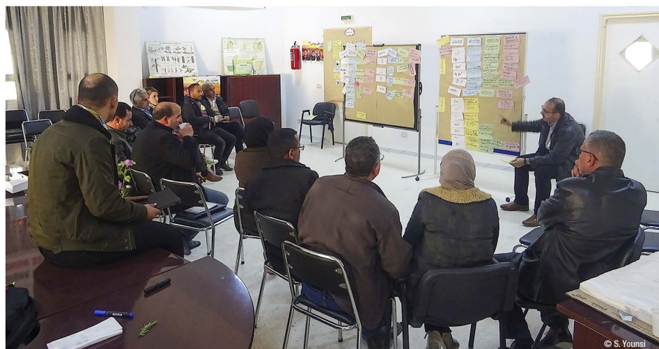
Figure 5.1. Training sessions strengthen the capacities of the facilitators, rural development officers

The RDOs themselves testify to the evolution of their skills and their posture. According to them, the acquisition of theoretical knowledge or “ new scientific notions ”, and know-how was facilitated by the frequency of the training sessions (“ Every two weeks, we have the chance to meet together to exchange, discuss and learn together. We have gained a lot of knowledge about group facilitation techniques, it is new knowledge and a new experience ”), as well as their adaptation to the pace of the programme (figure 5.1).