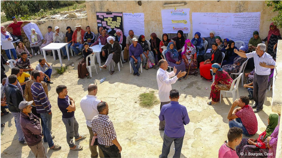
Figure 5.3. Feedback from a diagnostic of the Kairouan action zone

During the diagnostic phase, participatory workshops were organised to report and discuss the results obtained. This initiative aims to strengthen the validity and reliability of the data collected during the diagnostic phase.