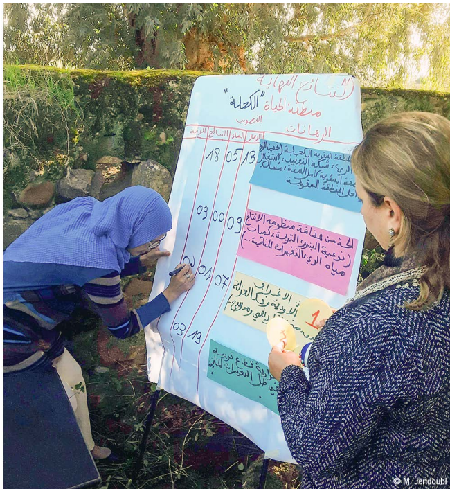
Figure 5.4. Voting on territorial issues in the Kairouan zone

During the diagnostic phase, participatory workshops were organised to report and discuss the results obtained. This initiative aims to strengthen the validity and reliability of the data collected during the diagnostic phase.