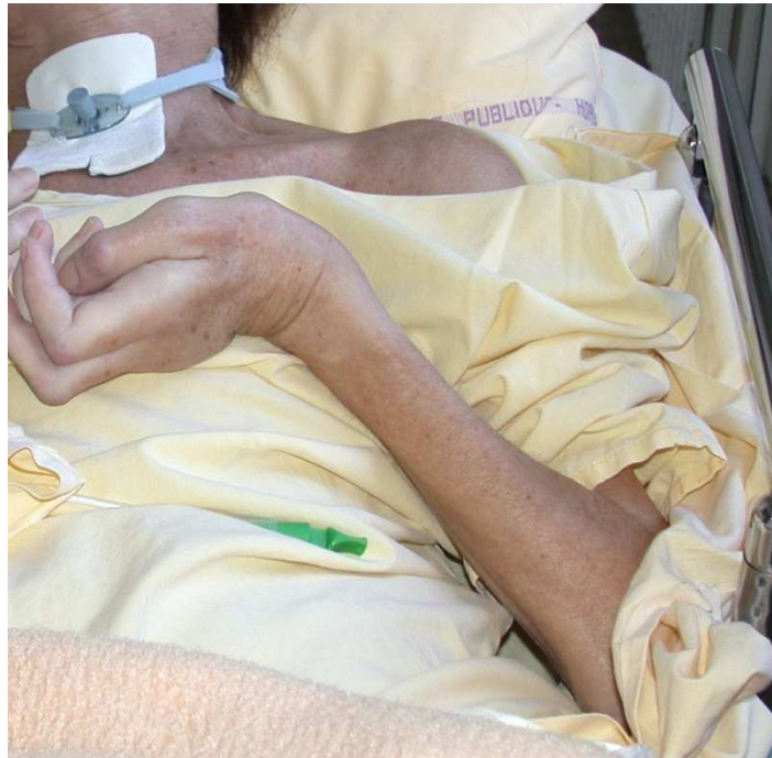
Fig. 3. Patiente tétraplégique C5 AIS A présentant une déformation classique en flexion-supination du coude et extension du poignet liée à une asymétrie musculaire en rapport avec son niveau neurologique.