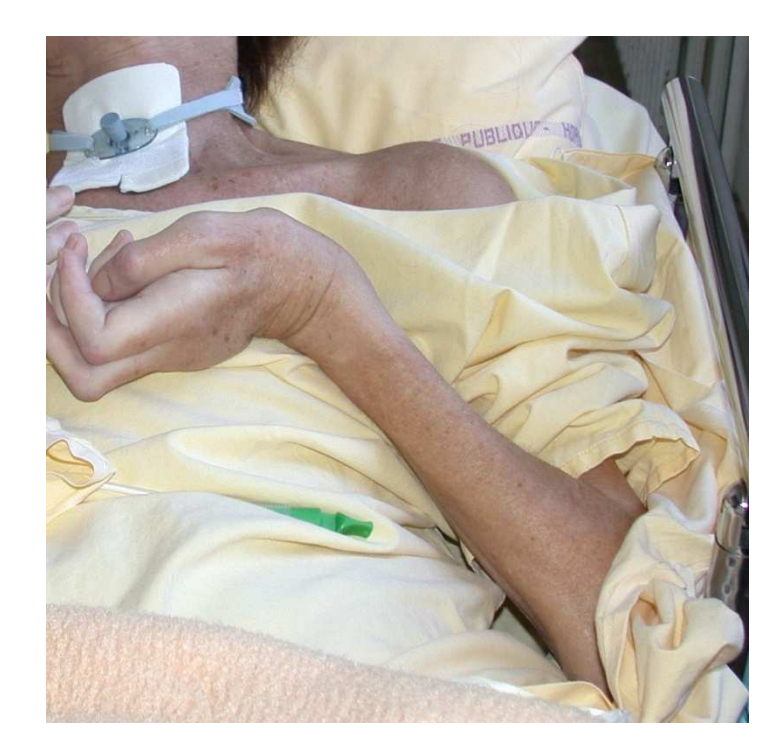
Fig. 3. Patiente tétraplégique C5 AIS A présentant une déformation classique en flexionsupination du coude et extension du poignet liée à une asymétrie musculaire en rapport avec son niveau neurologique.