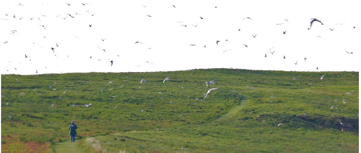
Fig. 2 - While moving towards the northern part of Vigur Island, one person inadvertently triggers a defensive reaction within the Arctic tern colony. / Mentre si sposta verso la parte settentrionale dell'isola di Vigur, una persona inavvertitamente scatena una reazione difensiva all'interno della colonia di sterne artiche.

Researchers must also consider Vigur Island's predominant activity of Eiderdown farming. During the first two weeks of June, eider down is systematically collected across designated sections of Vigur Island. When approaching a nest, the farmer carefully lifts the incubating duck – if it hasn't already flown away – temporarily moves the eggs aside and collects the down. The down