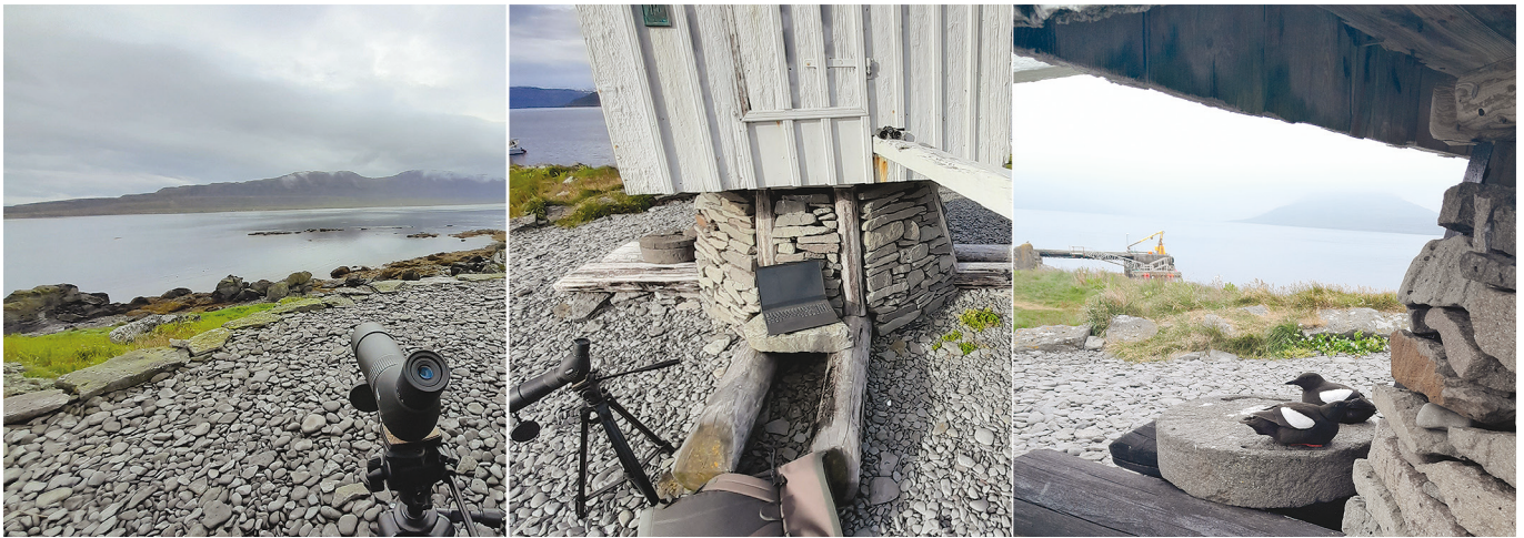
Fig. 3 - Windmill periphery: tourism impact to seal monitoring also hindered by nesting black guillemots and puffin lookout area (not represented on the photo). / Periferia del mulino a vento: impatto turistico sul monitoraggio delle foche, ostacolato anche dalla nidificazione delle urie nere e dall'area di avvistamento delle pulcinella di mare (non rappresentata nella foto).