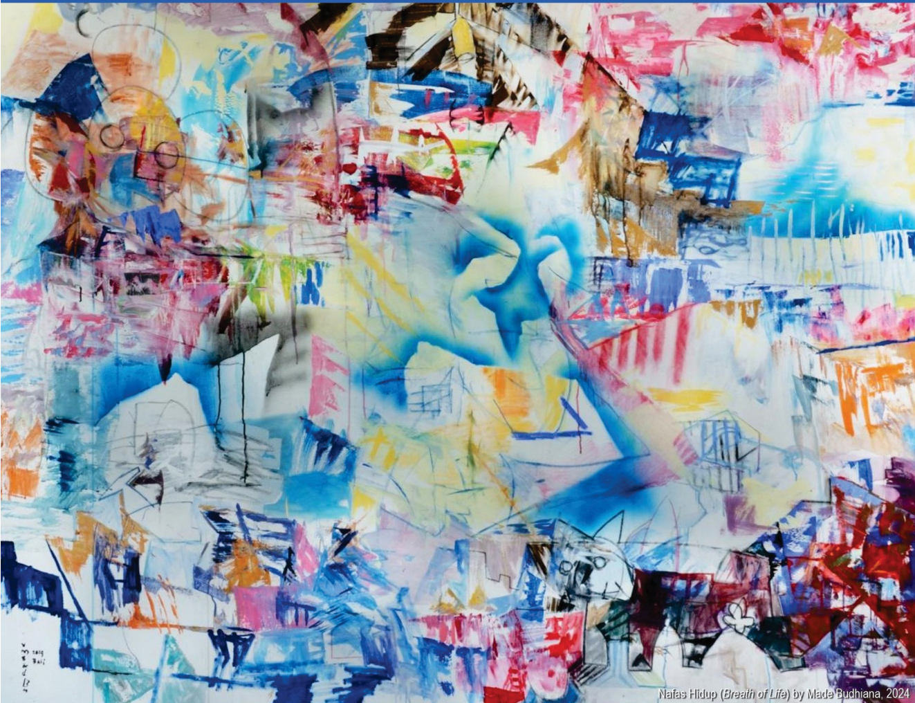
Nafas Hidup ( Breath of Life ) by Made Budhiana, 2024

Accredited Sinta-2; Indexed by Scopus (Since 9 December 2023)