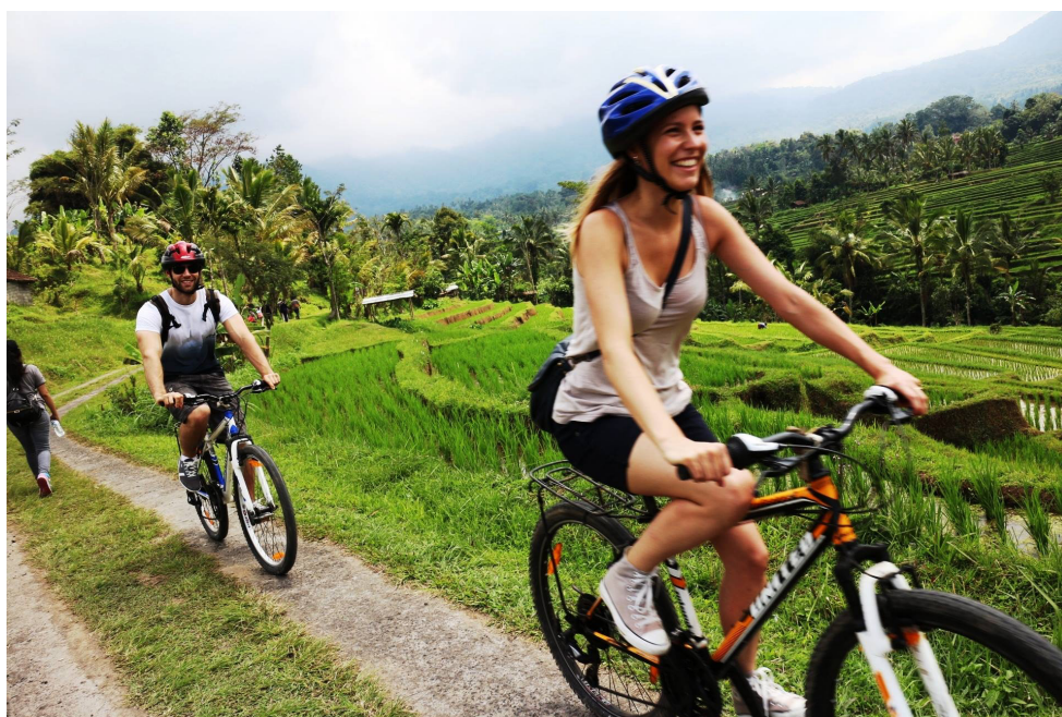
Photo 2. Tourists were cycling in Jatiluwih UNESCO World Heritage site, Bali

than the practice of farming itself. This would include the purchase of locally grown organic rice, for example, or enjoying fresh produce and meals on site, such as red rice tea produced by the local community in Jatiluwih. To be more attractive, product development must be undertaken (Middleton et al., 2020; Mill and Morison, 2009; and Kotler et al., 2017). For example, the diversification of attractions from agriculture produces become local products by involving postharvest technology. As agriculture produces are perishable and seasonal, there is a need for better education and training on postharvest technology (Suryawardani and Wiranatha, 2016). Appropriately qualified human resources are crucially needed in the agritourism and must be supported by government, research centres and NGOs through training and development programs.