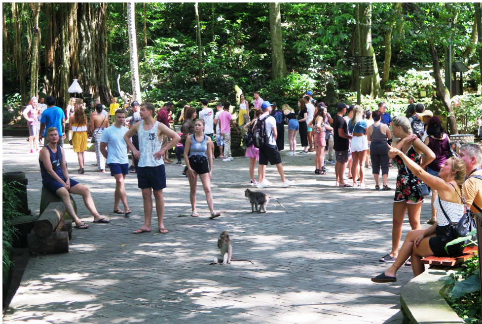
Photo 1. Monkey forest tourist attraction managed by local community of Padangtegal, Ubud, Bali.

Accessibility, 4) Ancillary Services, 5) Local Community Involvement, and 6) Marketing. These were further developed by creating sub-criteria for each of the main criteria.