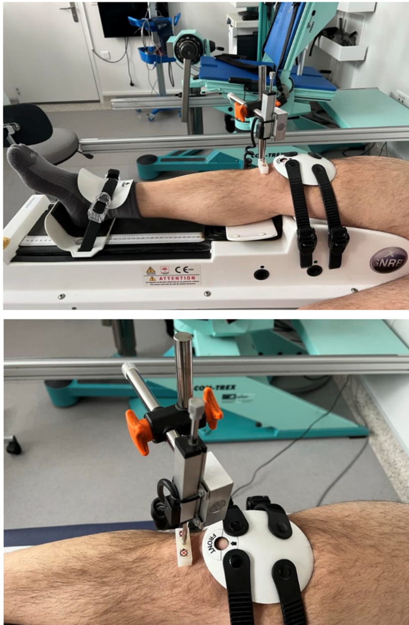
Figure 1. Patient position for GNRB® laxity measurements.

The second adjusted analysis considers the absolute value of the patellar tightening difference between the two knees and the mixed ratio of the pathological lower limb. It was performed only on GR1 and presented no statistically significant linear correlation at the 5% risk (Table 4).