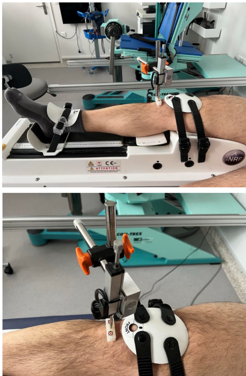
Figure 1. Patient position for GNRB® laxity measurements.

The second adjusted analysis considers the absolute value of the patellar tightening difference between the two knees and the mixed ratio of the pathological lower limb. It was performed only on GR1 and presented no statistically significant linear correlation at the 5% risk (Table 4).