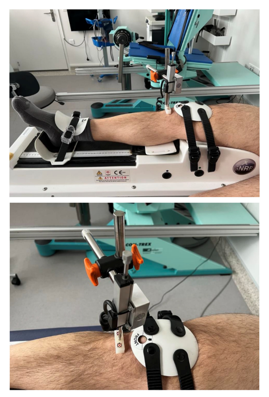
Figure 1. Patient position for GNRB® laxity measurements.

The second adjusted analysis considers the absolute value of the patellar tightening difference between the two knees and the mixed ratio of the pathological lower limb. It was performed only on GR1 and presented no statistically significant linear correlation at the 5% risk (Table 4).