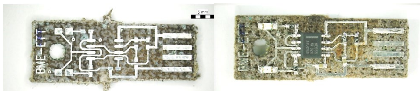
Figure 1. – Test circuit produced from PLA/Flax substrates (before – top, and after – bottom assembly).

In this paper we present one- and two-sided bio-based PCBs, which are based on a PLA/Flax composite with flame retardancy. PLA/Flax composites are used as bio-based prepregs (PLA-matrix with flame retardant additives and woven flax with added flame retardancy). The adhesive bond between layers were produced with flame retarded PLA powder. The starting copper layer is 35 \mu\text{m} thick, 1,5 and 2 mm substrate thickness was chosen for sample preparation. Basic designs were realized with traditional subtractive technology, but this paper mainly focuses on the thermal and RF characterizations. Figure 1 shows an example of an educational blinker circuit produced from the material before and after surface mounting, soldered with experimental vapour phase soldering reflow method at low temperature.