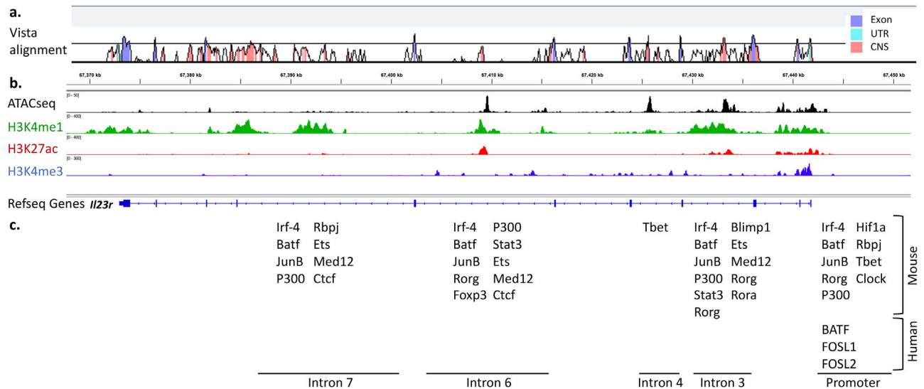
Figure 2. Transcription factors binding to the IL23r locus. (a) Alignment of the human and murine IL23R loci, obtained with the VISTA browser. Regions with >70% identity are marked in color: Conserved noncoding sequences (CNS) in salmon, 5' and 3'-UTR in light blue, and exons in purple. (b) Epigenetic marks tracks were obtained from the GEO database with the following GSM ID: ATACseq, GSM4731624; H3K4me1, GSM4291301; H3K27ac, GSM4291309; and H3K4me3, GSM4291303. (c) Indication of transcription factors bound to the murine and to the human IL23R locus obtained from published ChIP data.

controlled the inflammatory response by reducing the expression of proinflammatory cytokines such as IL17A and IL17F ; however, FOSL2 was also important for Th17 maintenance and survival since it increased IL23r , IL21 , and IL12rb1 expression [112]. Overexpression of FOSL1 and JUNB together promotes murine Th17 differentiation, increasing the expression of IL17 , Rorc , and IL21 . Consistently, inhibiting Fosl1 and Junb expression in vivo attenuated disease in an arthritis model [119]. Overexpression of FOSL1 in CD4^+ T cells from healthy donors led to an increase in IL-17 -producing cells and IL-17A secretion [119]. A recent study in humans showed that FOSL1 , FOSL2 , and BATF bind at the same site in the IL23R locus and at other Th17-associated genes. However, the study described a positive regulatory role of BATF but a negative role of FOSL proteins, since FOSL1 and/or FOSL2 overexpression decreased IL23R transcription. The authors suggested that BATF and FOSL proteins compete for binding to transcriptional partners and target genes [120].