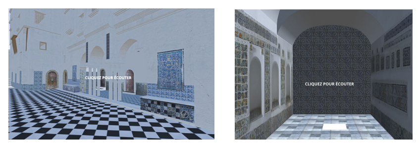
Fig. 5. Example of messages for the activation of annotations/audios: (left) in the marble courtyard and (right) Skifa.