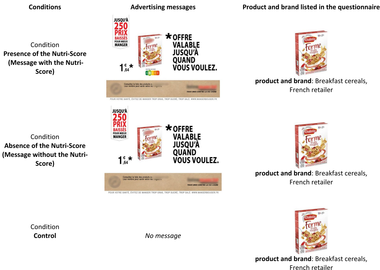
Fig. 1 Examples of advertising messages and products used in experimental and control conditions. Translation of advertising messages: *Offer valid until whenever you want—Up to 250 lower prices to eat better. All united against high prices

determinants of dietary behavior and the relationship between nutrition and health [16]. Volunteers aged 18 or older were recruited through various multimedia channels ( https://etude-nutrinet-sante.fr/ ). All participants were required to provide electronic informed consent when enrolling in the study. The NutriNet-Santé study is conducted according to the Declaration of Helsinki guidelines and is registered at clinicaltrials.gov (NCT03335644). The study was approved by the Institutional Review Board of the French Institute for Health and Medical Research 47 (IRB Inserm n°0000388FWA00005831) and the “Commission Nationale de l’Informatique et des 48 Libertés” (CNIL n°908450/n°909216).