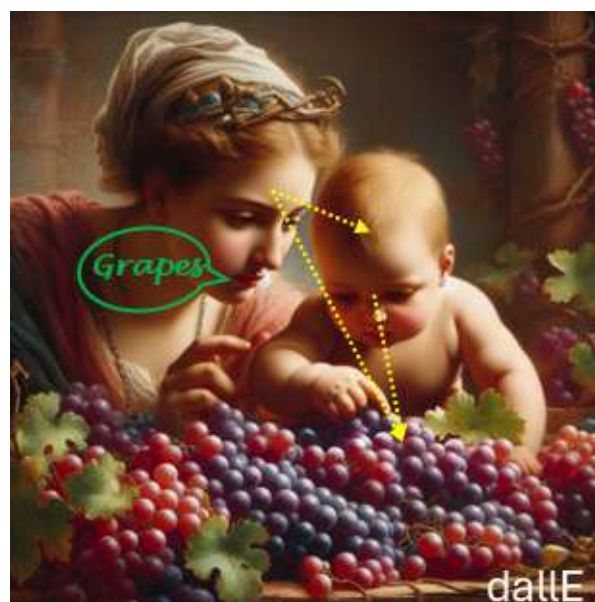
Figure 1: Explicit teaching requires both adult and child to be aware of the same object. This shared attention enables the mother to amplify the infant's perceptual awareness of the object and, eventually, to provide the infant with a symbol (a word) to represent the object. But at what age can infants have sufficient perceptual awareness to benefit from such teaching?

using these tones. While infants can form categories without the aid of speech/communication labels (Mareschal & Quinn, 2001; Quinn et al., 1993), a common label facilitates the categorization process by explicitly pointing to it (Kabdebon & Dehaene-Lambertz, 2019; Perszyk & Waxman, 2018). At a later age (9 months), they use the number of speech labels to deduce the number of objects hidden behind a screen (Xu, 2002), pointing and communicative cues vs grasping at 12 months to deduce the link between a word and a reference (Pomiechowska & Csibra, 2022), etc.. To use such cues effectively, infants are likely to maintain a stable and explicit representation of the task at hand: They must direct their attention to the signaled object and appropriately and accurately integrate the accompanying word.